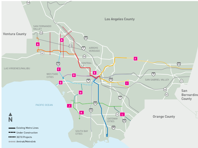
Figure 4: Planned Metro Rail Expansion. The map displays Metro's plans to extend its rail service using funds from Measure R and America Fast Forward federal legislation.

Over a hundred years ago, the Los Angeles Railway maintained a network of streetcars and narrow-gauge trains that helped connect the city in the decades before the advent of cars. With the passage in 2008 of a new sales tax dedicated to transportation improvements, L.A. may be on a road back to the future—Measure R is expected to generate more than $4 billion over 30 years to fund a vast expansion of L.A.'s Metro rail service. 25