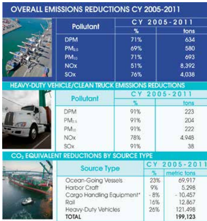
Figure 2: Air Quality Improvements at the Ports of L.A. and Long Beach. Emissions reductions in percentages and tons from 2005 to 2011, following the Clean Air Action Plan. Expanded pollutant acronyms: DPM - Diesel Particulate Matter, PM 2.5/10 - 2.5/10 micron particulate matter, NOx - Nitrogen Oxides, SOx - Sulfur Oxides. Truck emissions, regulated by L.A.'s Clean Trucks Program, accounted for the majority of greenhouse gas emission reductions.

A centerpiece of those efforts was L.A.'s Clean Trucks Program, aimed at modernizing the 17,000 mostly inefficient diesel trucks that haul goods to and from the Port. The law imposed stringent emission regulations, immediately took 2,000 pre-1989 trucks off the road, and has culminated in a clean fleet of 5,500 trucks powered by electricity or alternative fuels like natural gas. 16 As a result, harmful emissions (diesel particulate matter, nitrogen and sulfur oxides) from trucks have plunged 80 percent ; across the two ports, the Clean Air Action Plan is on target to reduce the risk of cancer in adjoining communities by 85 percent. 17