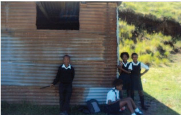
Image 2: Students outside their Junior Secondary School in South Africa.

Equalizers, EE's most active members, are at the center of much of its work. These high school students are from predominantly poor and working class areas. They engage with the organization through a variety of activities ranging from weekly youth groups, mass meetings, camps and marches. Equalizers play a leading role in the activities of the organization. They work with EE, along with parents, teachers, activists, and community members, to improve schools in their communities. They set an example to their peers through their dedication to their own education, and in addition to boosting EE's growing youth support, has helped to mobilize the support of parents and communities. Parent networks ensure that parents are informed and given a platform to support the advancement of equal and quality education in South Africa.