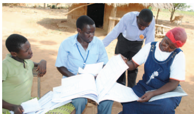
Volunteers, Kumi district, Uganda.