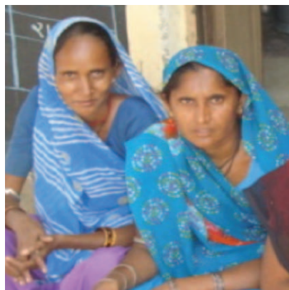
Blue sari mother.

"I am very puzzled," I continued. "Why is it that even though you are illiterate you know exactly what you need to do when a child has fever, but when it comes to her schooling you don't do anything when she cannot read?" The blue sari mother was ready with her answer. "That is very simple," she explained. "We go to the doctor only sometimes; only when there is problem. Not every day. It is not the doctor's job to come and take care of my children. I have to