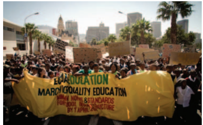
Image 3: 20,000 Equal Education activists march on Parliament on Human Rights Day, 2011.

Many parents have experienced negative or harmful school environments, having been educated under Bantu Education. These parents often felt intimidated and were less aware of what to expect from schools and government. To develop understanding of educational issues among parents and to encourage their support and action, Equal Education has run educational workshops with parents and involved them in campaigns, advocacy work and school based projects, such as supervised after-school homework classes.