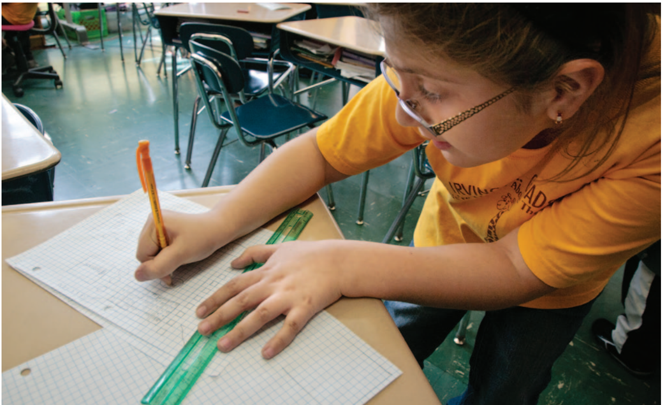
The ExpandedED program offers participants everything from homework help to tap dance.

One result of their teamwork is a richer reading experience for the students. In a typical English Language Arts (ELA) class at P.S. 186, the teacher-student ratio is 1 to 27, and that one instructor is obligated to cover a number of distinct reading competencies, such as phonics, vocabulary development, comprehension and motivation to read. In the ExpandedED portion of the day, however, the ratio is 2 to 20, and that same teacher, joined by an NIA educator, is free to focus on a specific area in which students need extra help. And while state tests have prompted an emphasis on short, nonfiction passages during the regular school day, ExpandedED gives students the opportunity to read and discuss books popular with kids—such as Amber Brown Is Not a Crayon —ensuring that achievement doesn’t come at the expense of enjoyment.