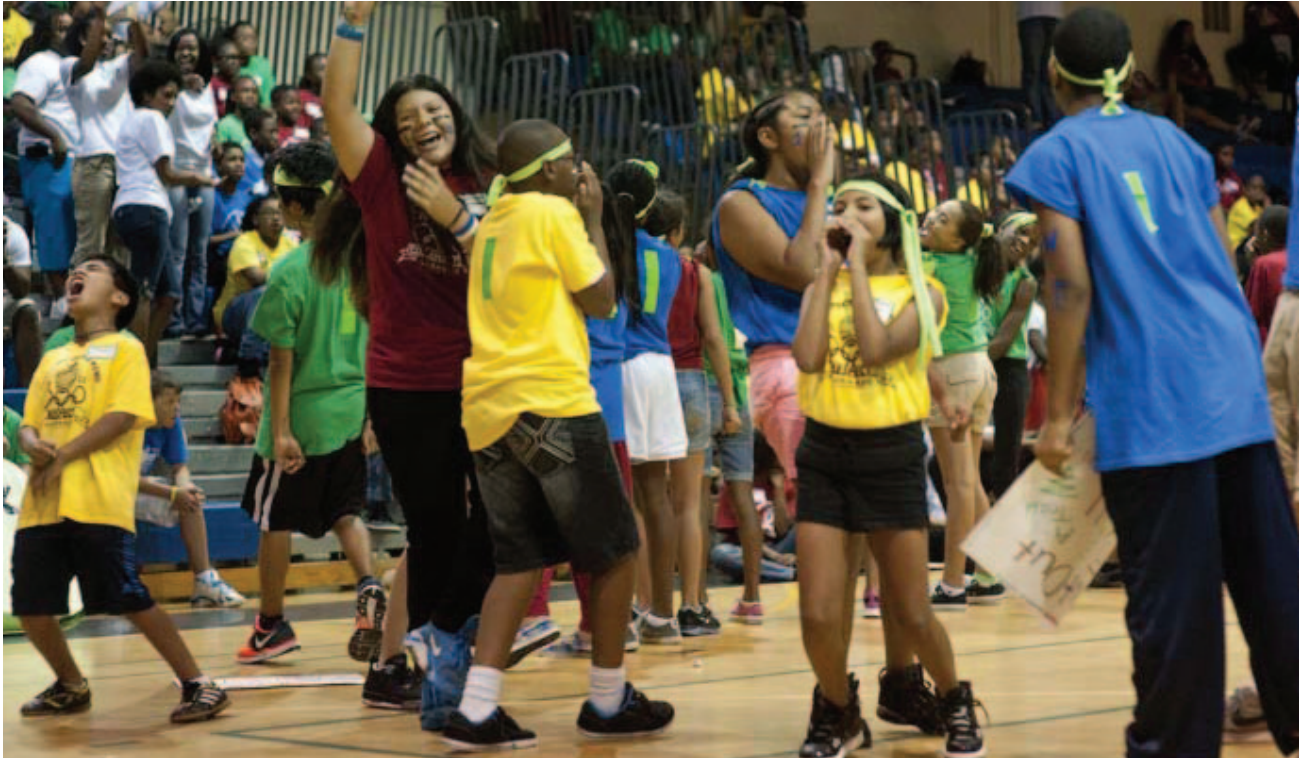
Higher Achievement's Summer Academy ends with the annual Olympics of the Mind, an event where students engage in academic and athletic competitions.