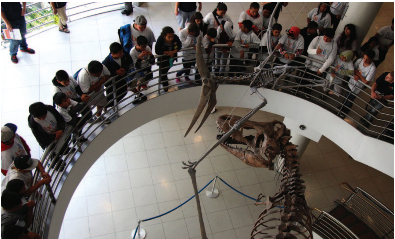
Field trips are part of the experience for BELL students at Davidson Middle School, shown here looking at the T. rex at the University of California, Berkeley’s Museum of Paleontology.