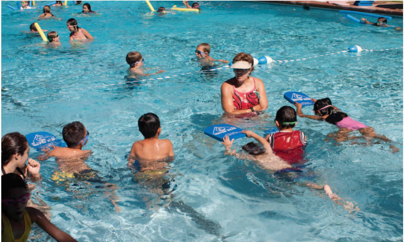
Students at the Horizons National program at the Colorado Academy in Denver take part in the swimming lessons that are part of the Horizons model.