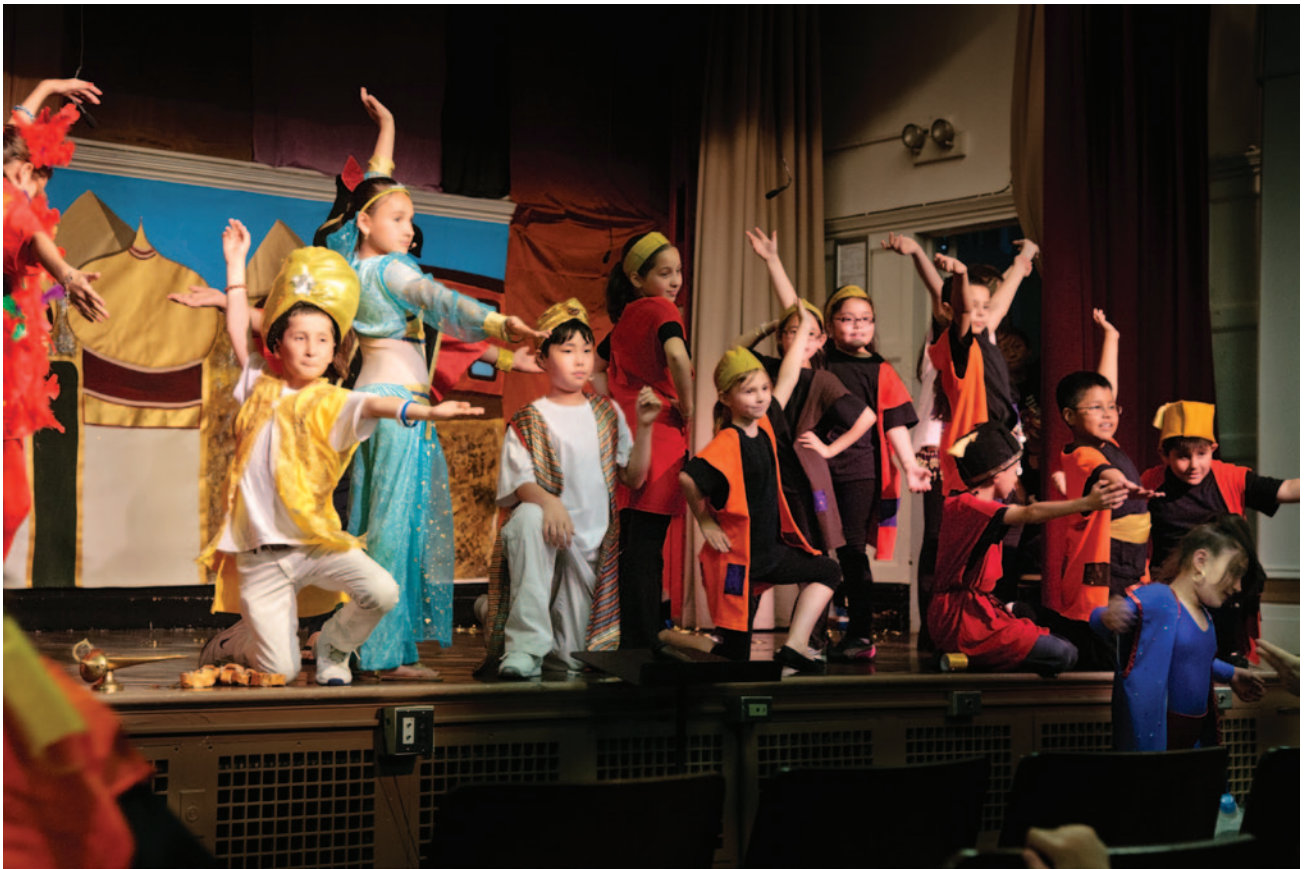
A year-end theatrical performance is one of the activities children in the ExpandedED program at P.S. 186 can look forward to.

Even nonacademic offerings support the learning that takes place during the school day. Take, for example, tai chi, the system of gentle exercises. At P.S. 186, ExpandedED students practice tai chi poses to help them cope with frustration and anxiety—which can afflict even young children in an education system geared toward testing and accountability. As one third-grader says, “ELA tests are hard. Sometimes it makes us nervous, but tai chi helps us relax.”