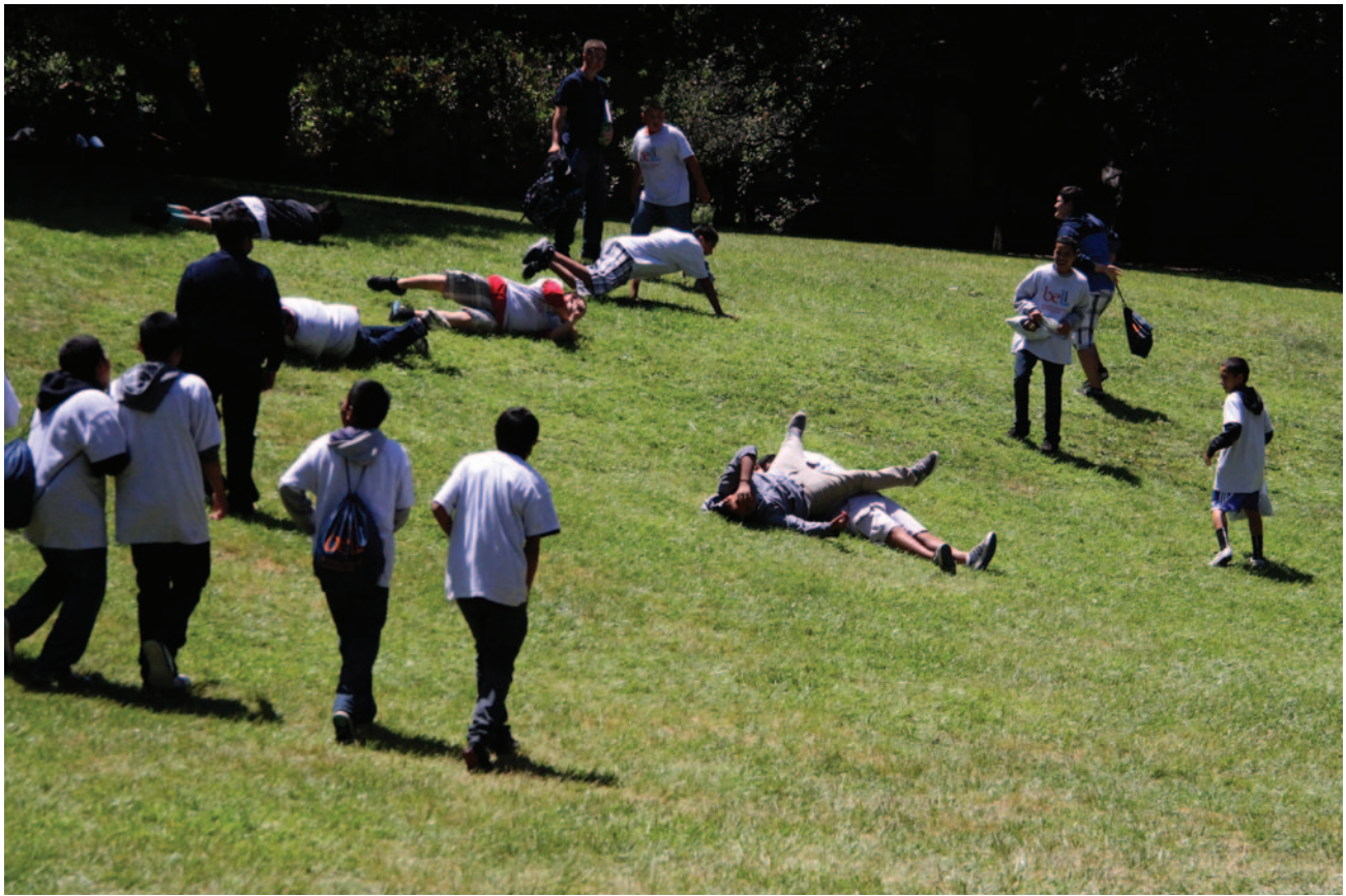
Students from Davidson Middle School hurtle down a hill on a visit to the University of California at Berkeley.