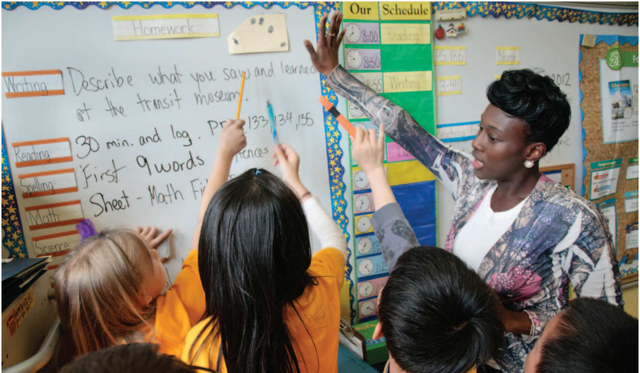
At the ExpandedED program at Brooklyn's P.S. 186, students examine "fingerprints" in an afterschool forensics program.