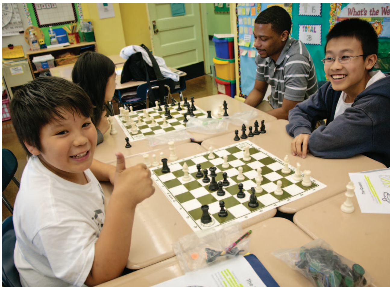
Chess is on the schedule, too, for ExpandedED students at P.S. 186.