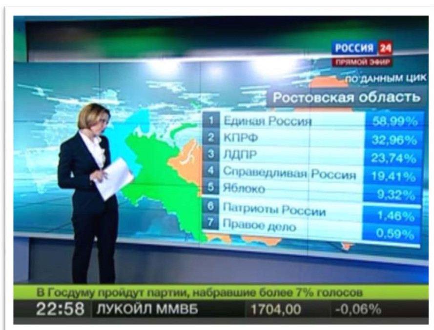
The state-owned television station Rossiya 24 broadcasts the results of the December 2011 parliamentary elections, showing a breakdown of votes by party for the Rostov region that apparently totals 146.47 percent.