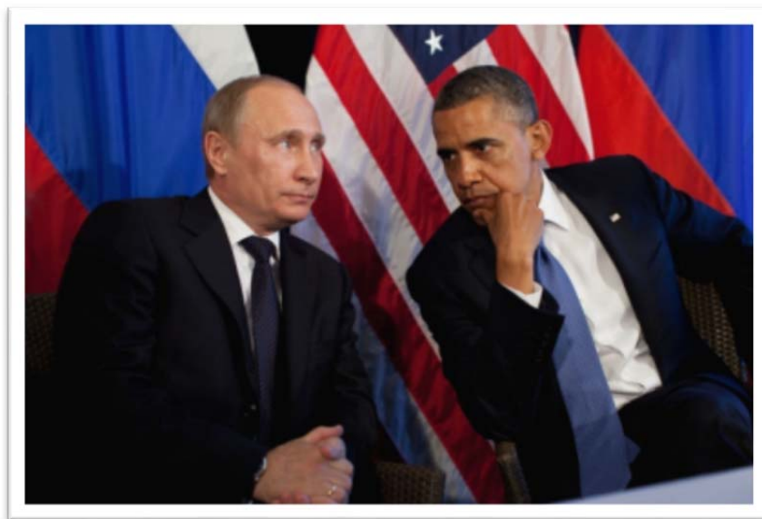
President Barack Obama meets with Russian president Vladimir Putin at the Group of 20 summit in Los Cabos, Mexico, 18 June 2012.

As the administration of President Barack Obama prepares for various foreign policy challenges in its second term, a new approach to dealing with Vladimir Putin's Russia should be on the agenda. Since his formal return to the presidency in May of last year, Putin has overseen the worst deterioration in Russia's democracy and human rights situation since the collapse of the Soviet Union and is attempting to reestablish a fear of dissent in society. The Russian government's malign influence also extends beyond the country's borders, as it has propped up authoritarian systems ranging from that of Belarusian dictator Alyaksandr Lukashenka to the murderous Syrian regime of Bashar al-Assad.