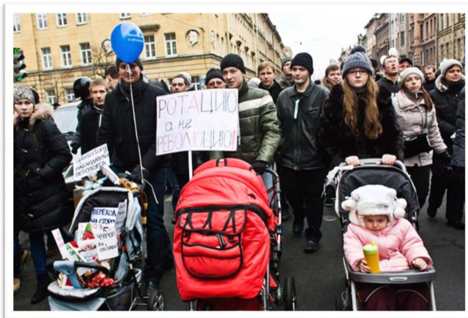
Families in St. Petersburg hold a sign reading "Rotation, not Revolution!" as they participate in a demonstration in early 2012 to call for free and fair elections.

The new approach to Russia should include a sustained effort to overcome regime obstacles and find innovative ways to support groups and individuals working for political liberalization inside Russia. Without outside support, a number of respected Russian human rights organizations would go out of business. This effort will require coordination with allies and, importantly, a certain degree of tact. Last spring, U.S. officials clumsily announced the administration's interest in creating a new $50 million fund to support democracy activities in Russia. The statements were designed in part to forestall the inclusion of the Magnitsky Act in the legislation lifting the Jackson-Vanik amendment, but they had the effect of painting an even bigger bull's-eye on American funding for Russian civil society.