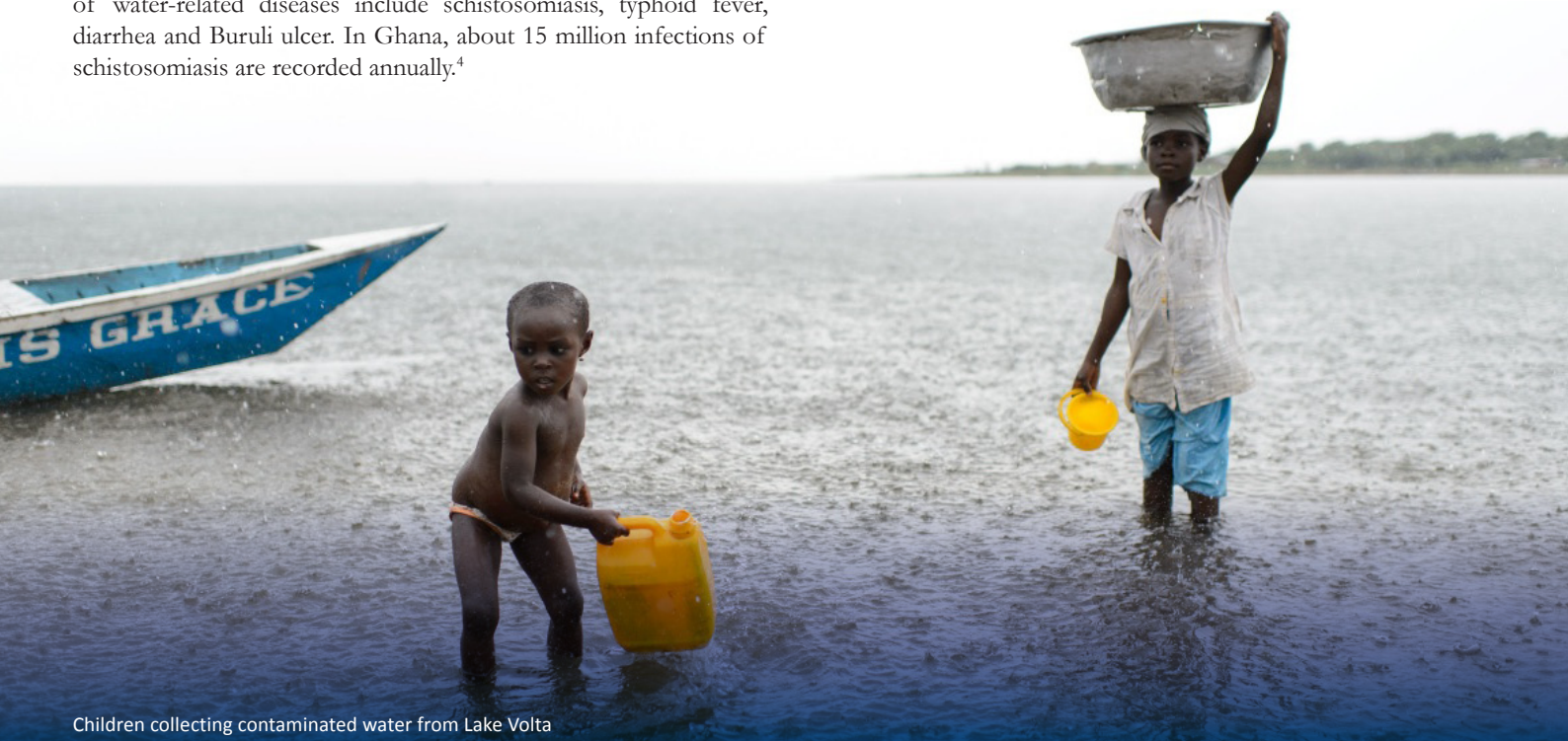
Children collecting contaminated water from Lake Volta