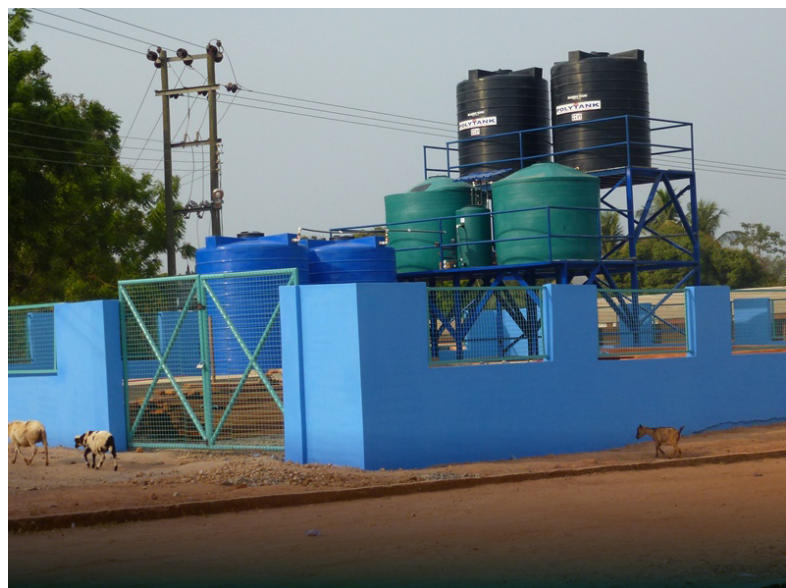
Safe Water Network's Modular Slow Sand Filtration System, Aveme, Volta Region

communities with significant pumping requirements. On the other hand, smaller communities are least likely to have electricity supply, which makes solar electricity a necessity for a mechanized water system. There is also the potential to generate additional revenue from adjunct businesses, such as cell phone charging. Solar power could help to serve up to 8.5 million people in rural areas 9 .