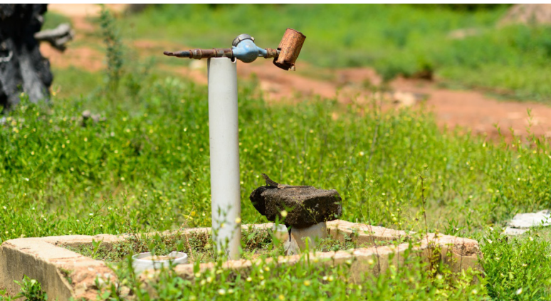
Broken municipal borehole in the Volta Region, out of commission for over a year for the want of GHC 20 (US$10)