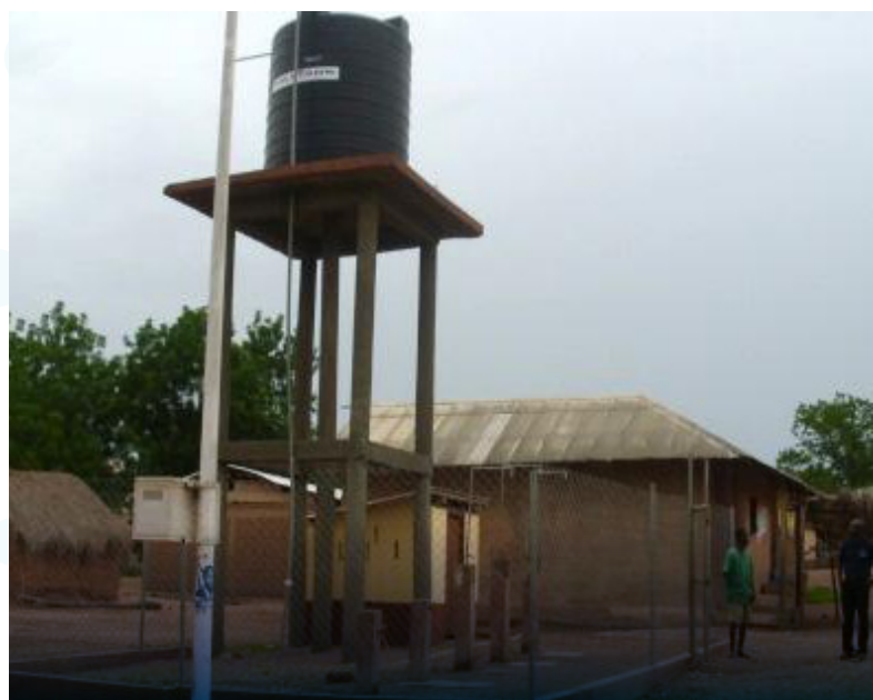
Limited Mechanization System, Somsei, Eastern Region (Case study available in Final Report)

In addition to water treatment options, solar power can reduce operating costs and provide water access to communities without a reliable source of electricity, most of which are poor rural communities. Although the capital outlay is higher than for grid-based supply or diesel generators, the price of solar panels has decreased significantly and continues to drop. On a purely economic basis, solar power is most appropriate for larger