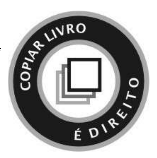
Logo of the "Copiar..." campaign

Publishers argued that if libraries were poorly stocked, students should buy their own copies of