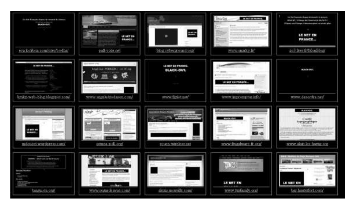
A few screenshots from the HADOPI blackout campaign

Again in coalition with other groups, La Quadrature worked to neutralise the proposals by promoting a series of favourable amendments to the legislation. Key in this campaign was getting the plenary vote on the Package postponed from 2 September, right at the start of the EU Parliamentary session, to 24 September. This allowed for almost a month of significant campaigning, that in turn resulted in a positive outcome: 90% of amendments they promoted rated as "+++" (the most important) were adopted. As a result the package has now gone to a second reading, and could well be delayed until after the European elections.