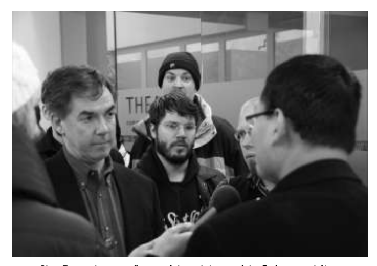
Jim Prentice confronts his critics at his Calgary riding Christmas party

Geist launched the Facebook group, called Fair Copyright for Canada, on 2 December 2007 with low expectations of participation. But within a day it had 1,000 members. By the second day, it had 2,000 members, and by the end of the week, 10,000 members. Inevitably, the size of the Facebook group drew the attention of bloggers and the mainstream media – it was the first successful attempt to mobilise people on Facebook in Canada, a country with a high proportion of Facebook users. This created a virtuous circle: the more people who heard about the group, the more people who joined it, and the more people who joined it, the more the media talked about it.