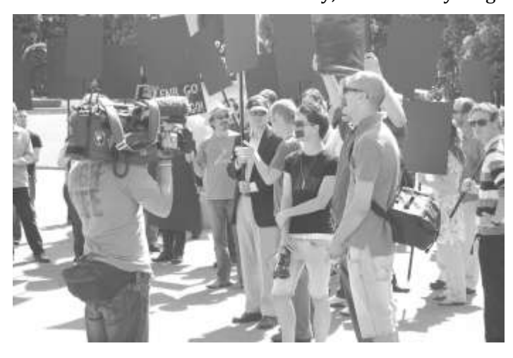
Protesters gather outside the New Zealand Parliament

Although Creative Freedom have no hard statistics on how many people acted on their call to action, they estimate that tens of thousands of people supported the internet blackout campaign in some way. Anecdotal evidence suggests there was a high take-up both within New Zealand and internationally, with many high-profile figures, including British