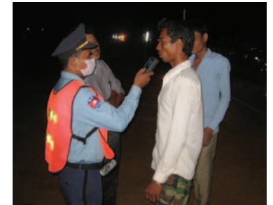
Police administer breathalyzer to test driver for blood alcohol concentration in Cambodia