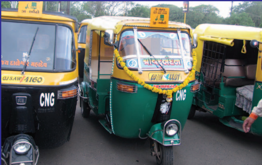
New auto-rickshaw fleet in Rajkot, India