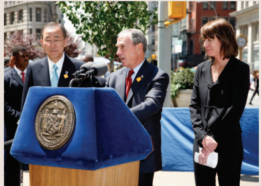
Mayor Bloomberg with Janette Sadik-Khan, Commissioner of the New York City Department of Transportation, and Ban Ki-Moon, Secretary General of the United Nations, launch the Decade of Action for New York City on May 11, 2011.