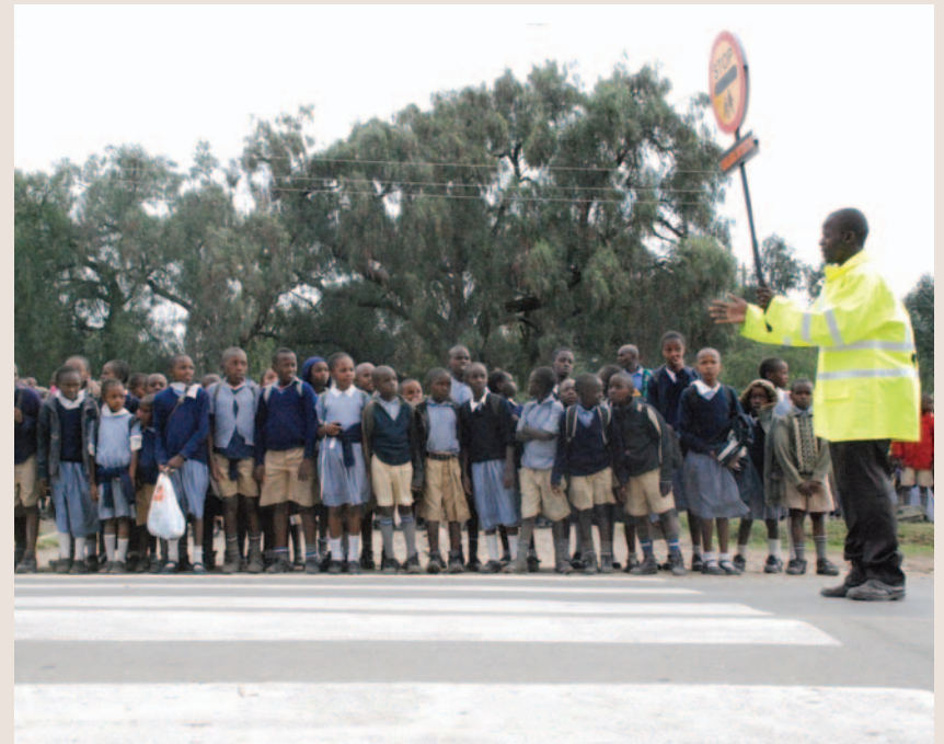
Children wait to cross the road in Kenya