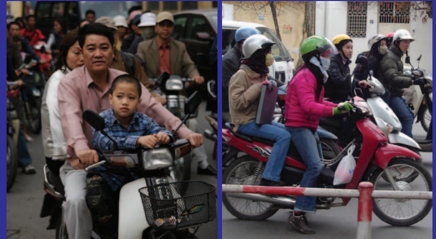
Before and after the 2007 helmet law, Vietnam