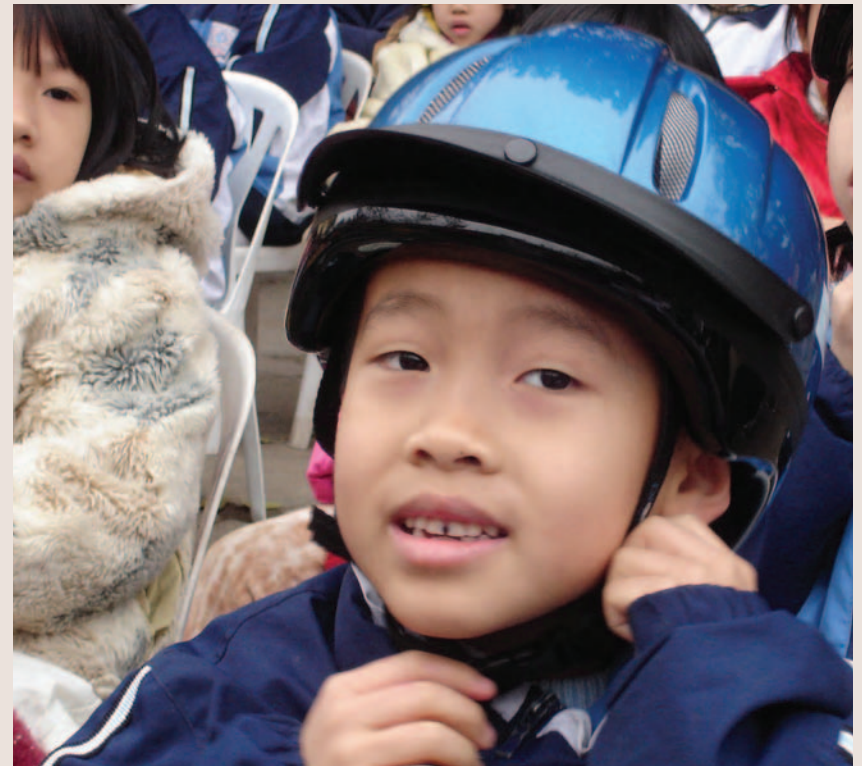
Vietnamese children learn about the importance of wearing helmets