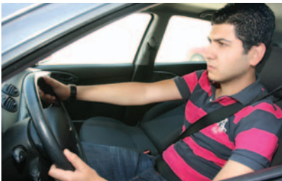
Driver in Afyon, Turkey