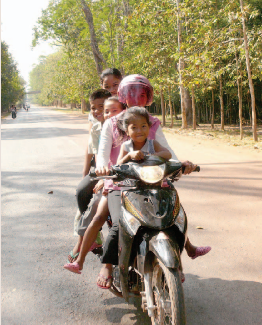
Cambodian family without helmets