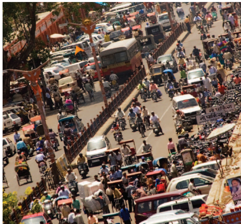
Traffic chaos in Rajasthan, India

Countries passed or strengthened road safety laws