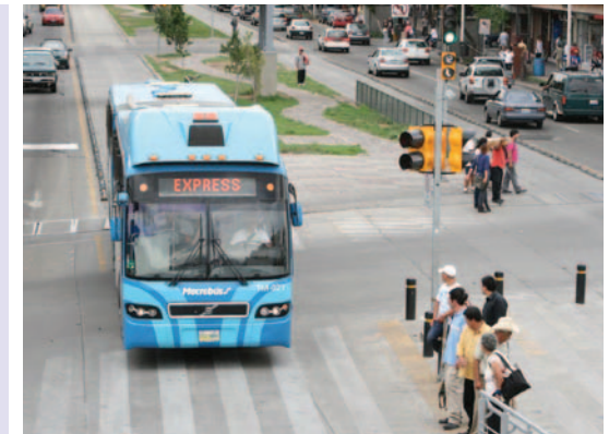
Macrobus corridor in Guadalajara, Mexico

The city of Rajkot, India launched the country's first modern fleet of auto-rickshaws in November of 2012. This fleet will help unify auto-rickshaw service under one brand (G-Auto) and operational structure in Rajkot, which has a population of 1.3 million people. There are roughly 10,000 auto-rickshaws in Rajkot, 150 of which are part of the G-auto brand, with the goal of scaling up to 1,000 participating auto-rickshaws by 2013 and eventually all 10,000 auto-rickshaws. Bloomberg partner, EMBARQ India, is working with the municipality of Rajkot to improve safety, service, and environmental impacts. The new dispatching service will help reduce unnecessary trips to avoid exposure to risk of traffic crashes, as well as lead to improvements in auto-rickshaw vehicles and infrastructure. Rajkot's G-Auto model could be scaled up across India, where 140 million auto-rickshaw trips are completed each day. Already, the city of Surat has replicated Rajkot's innovation with its own pilot. Other cities in India will follow.