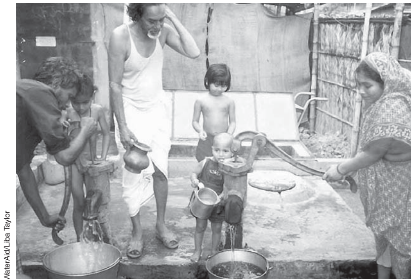
Photo 1: Water points consist of an underground storage reservoir, two hand-operated pumps and space for bathing and laundry