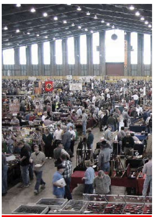
Between 2002 and 2005, more than 400 guns purchased at gun shows in Richmond, Virginia, were later recovered at crime scenes.

It has been argued that increased regulation will drive gun shows out of business. To the contrary, the Wintemute study indicates that gun shows in California, which are strictly regulated, have a higher number of attendees per