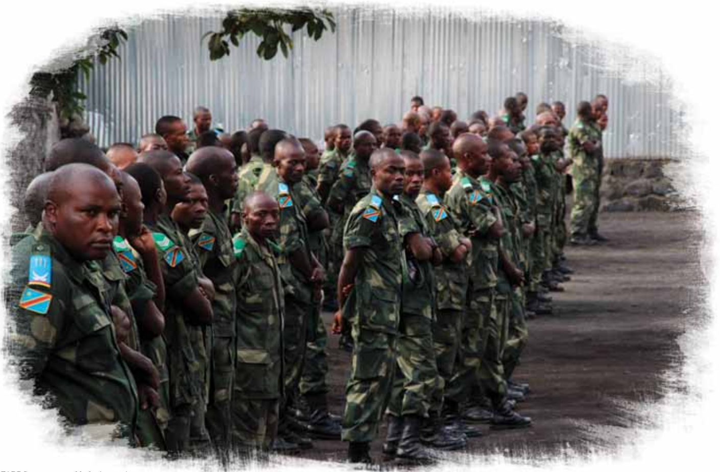
FARDC troops assemble for inspection.