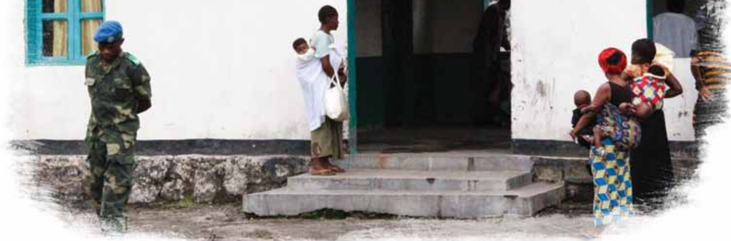
The rudimentary hospital in the camp provides basic medical services to military families.

ARTENARIAT DSS 8 REGION MILITAIRE-UNFPA. BATIMENT CONSTRUIT AVEC L'APPUI DE L'UNFPA Service de Planification Familiale. CPN & CPS