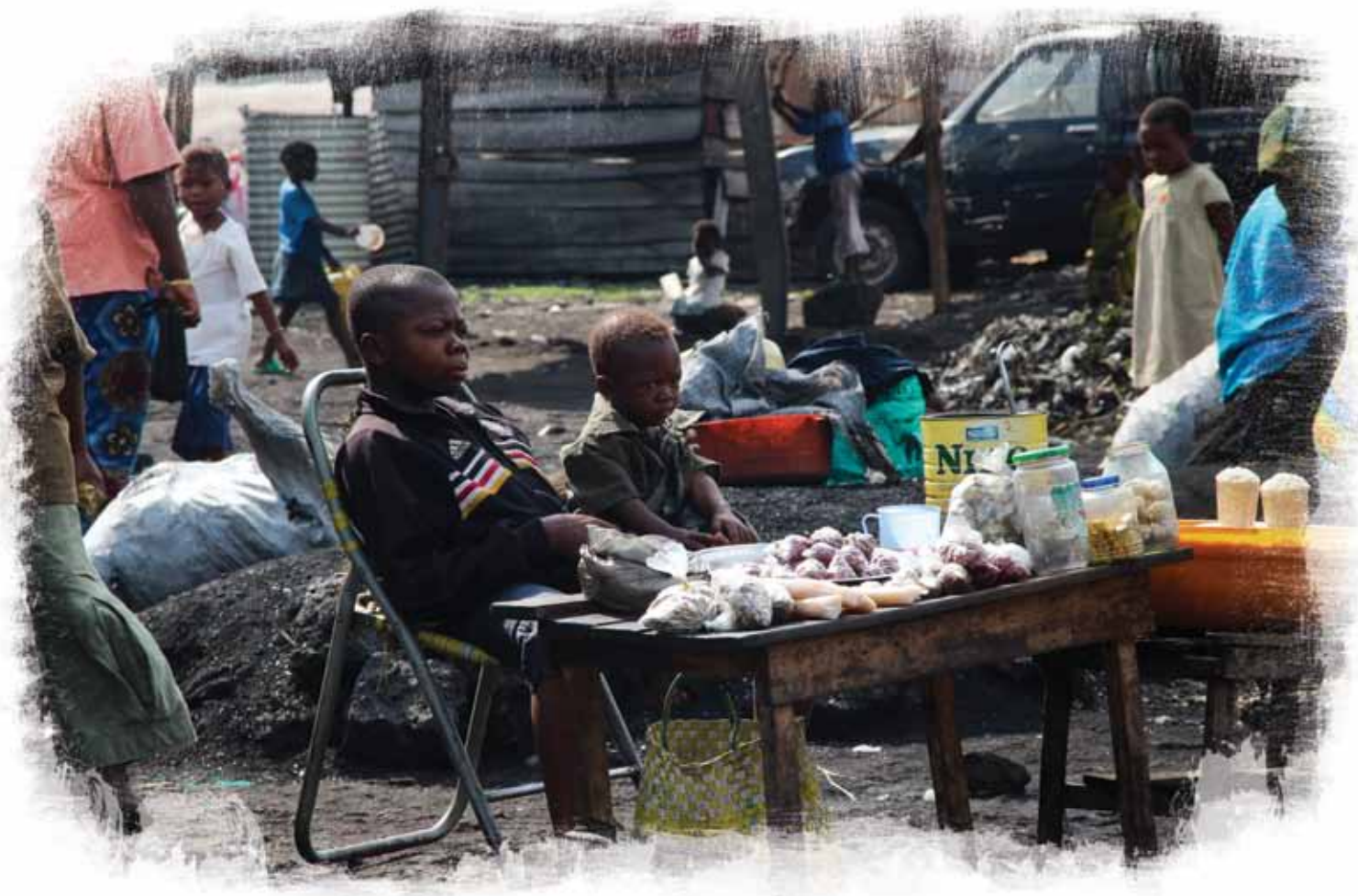
Most military families cannot afford to send their children to school. Children often work from a young age to contribute to the family income.

9. But these issues are as much a result of continued failures of SSR as they are the cause – and they do not present a compelling reason to ignore the need for SSR. The fact remains that the Congolese government consistently failed to give sufficient political backing for serious change. Most importantly, it did not take steps to end corruption, ill-discipline and weak command structures undermining reform efforts in the security sector. Despite President Kabila's high-profile declaration of 'zero tolerance' for sexual violence and corruption in July 2009, not enough has changed on the ground. Support to justice, investigation and anti-corruption efforts are minimal and inadequate – the Justice Ministry was allocated just 0.1% of government spending in 2011 39 , and its budget reportedly fell by 47% between 2007 and 2009 40 . Many in senior positions in the government and military continue to profit from corruption, either in raking off salaries, taking kickbacks, or involvement in illegal mining, trade or protection rackets.