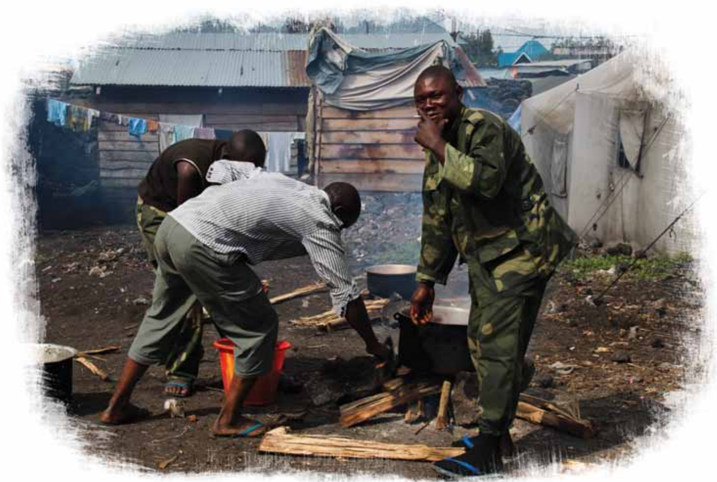
Soldiers cooking their breakfast on a campfire. Many troops are missing basic requirements like military issue boots.