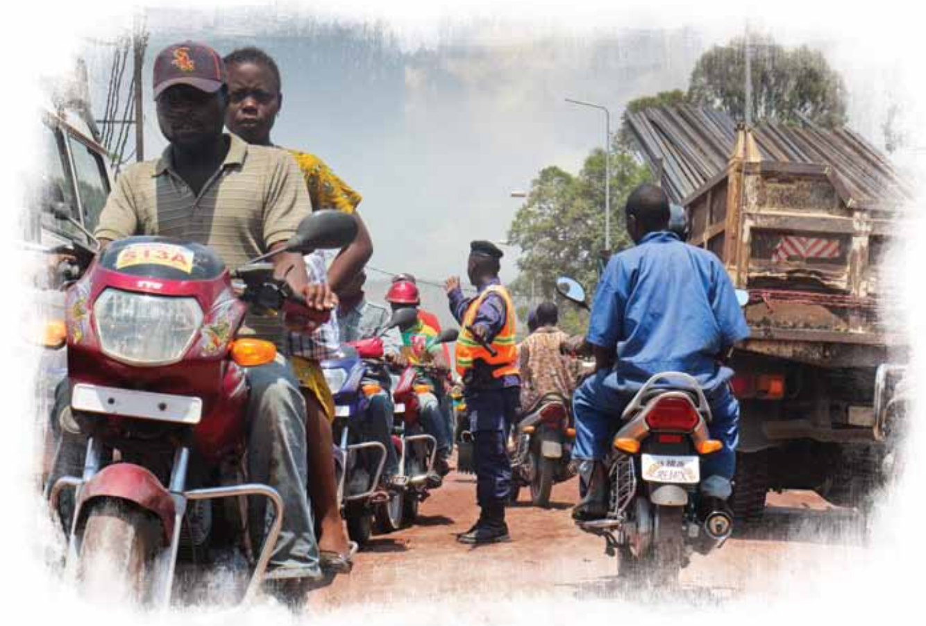
Congolese police patrol the main streets of Goma.

18. The result has been a range of disconnected bilateral initiatives on training, sensitization, infrastructure rehabilitation or capacity building. There have been some successes, notably in relation to justice and police 59 , and in the performance of some military units, though many were short-lived, due to a subsequent lack of support - accommodation, equipment and salaries - or the break-up of units. Some offers of training have not been taken up, with centers and instructors standing idle. There have been attempts to engage with structural issues within the FARDC undertaken by MONUSCO 60 and EUSEC, a mission of the European Union launched in 2005. Involving small numbers of embedded European officers, EUSEC has had some success in relation to the 'chain of payments' - ensuring salaries reach individual soldiers - and in conducting a census of FARDC personnel, as well as in administrative reform 61 . But while these initiatives have been valuable, they are not sufficient to bring about systemic change.