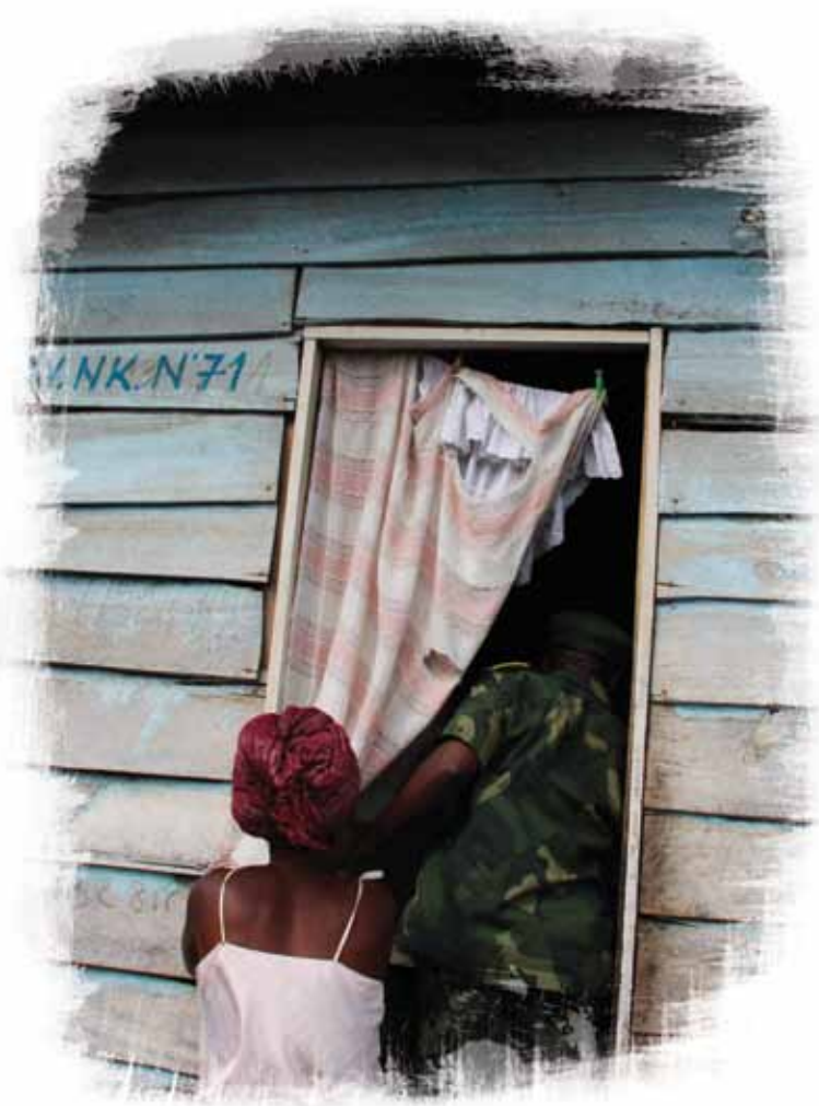
Officers' Quarters at Camp Katindo in Goma, North Kivu province. Originally intended to house 150 people, the camp is now home to more than 16,000 people including many soldiers' families.

8. This was in part due to a lack of capacity and a very low baseline for reform. The integration of former belligerents into unified military and police structures during the transition, a process known as 'brassage', was partial and ineffective 35 . Parallel chains of command survived within the army and other security structures, and tens of thousands of combatants remained in non-state armed groups. Government administrative control was weak, notably in the East. The post-2006 administration immediately faced a variety of armed opponents 36 . Additionally, sensitivity to international interference on security issues was acute - the close supervision that the international community had exercised during the transition, embodied in CIAT 37 and MONUC, had been a source of considerable frustration, even humiliation. Memories of wartime occupation were vivid, by powers widely perceived - rightly or wrongly - to be acting on behalf of elements of the international community 38 . The government is defensive of its autonomy, and wary of dealing collectively with the international community.