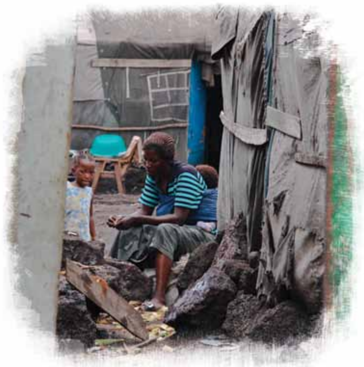
A military family living in Camp Katindo, North Kivu. Most families in the sprawling army camp live in tents or makeshift structures.

28. The international community must recognize this imperative. It must act on it. All other objectives – humanitarian, developmental, economic or security-related – will be difficult or impossible to achieve without concerted SSR. The DRC's external partners must make a collective stand on serious security sector reform, both to engender political will and to support resulting Congolese reform processes. The Congolese government has received significant financial and diplomatic support since the end of the war. The weight of these commitments must be brought to bear.