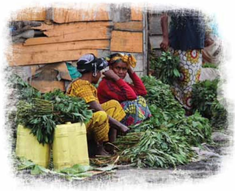
Military wives seek to supplement their income with small-scale trade in the local markets. "We have to beg for support from our acquaintances. The government does not support us at all," said one soldier.