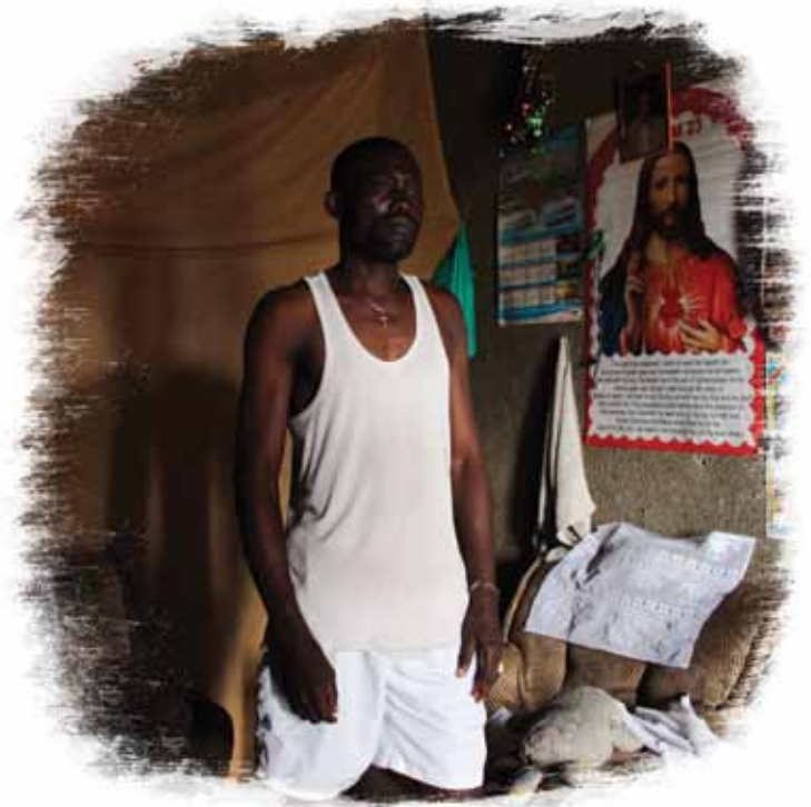
A soldier at home in his barracks, Katindo Camp, Goma.

45. The EUSEC project on reform of the Congolese military demonstrates that structural reform need not be expensive if support is correctly targeted. EUSEC was launched in 2005 and embedded small numbers of European officers at senior levels in both headquarters and with individual units. Designed to offer strategic advice and targeted support, its most significant initiatives have been working on the 'chain of payments' –