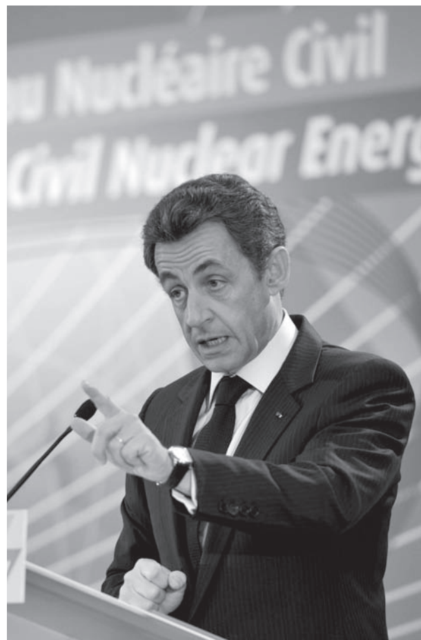
French President Nicolas Sarkozy delivers a speech at the International Conference on Access to Civilian Nuclear Energy in Paris, France on March 8, 2010.

Preparation is underway for the 2012 NSS to be hosted by the Republic of Korea . An inter-minis-