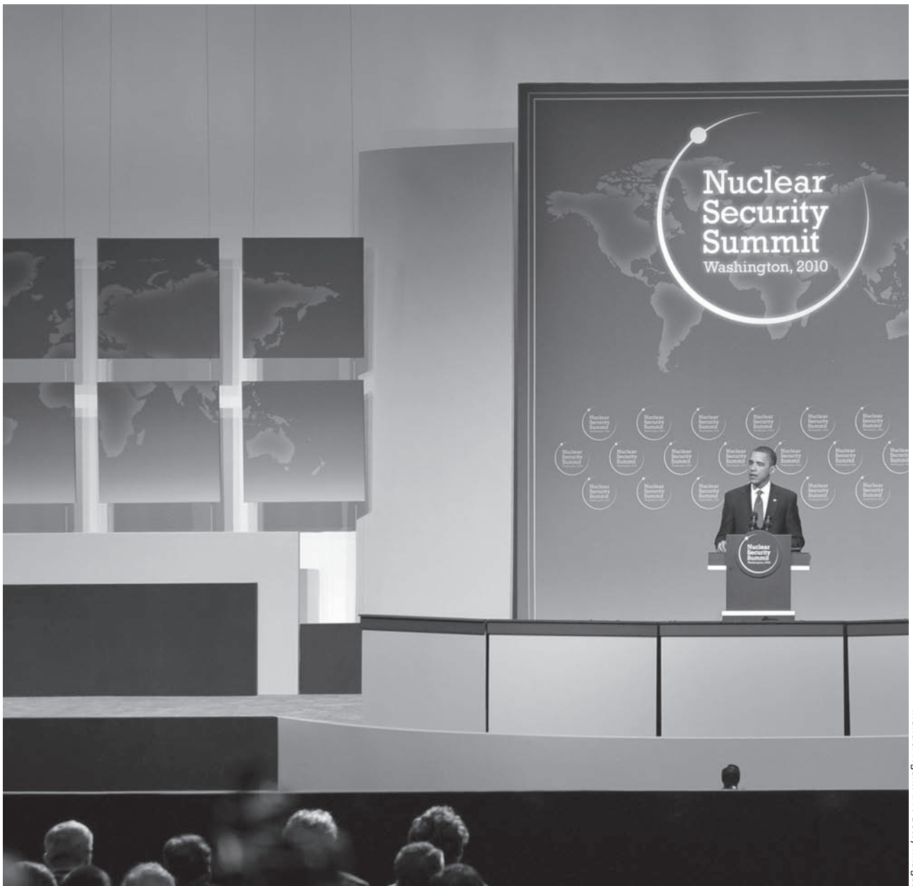
U.S. President Barack Obama holds a press conference at the conclusion of the Washington Nuclear Security Summit on April 13, 2010.

are often not publicized in open sources. The extent to which non-governmental organizations can be involved in the monitoring and tracking of commitments made at the first NSS is largely dependent on items reported in open sources. The information contained in this report is accurate and up to date to the best of our knowledge as of March 2011. Given that the summit process is the main mechanism by which the Obama administration is coordinating efforts to implement its nuclear security agenda, we hope to play a constructive role in taking stock of what progress has and has not been made. Our aim is to provide a broad audience with information on the status of commitments made at the 2010 summit as well as a basis for looking forward to the 2012 meeting.