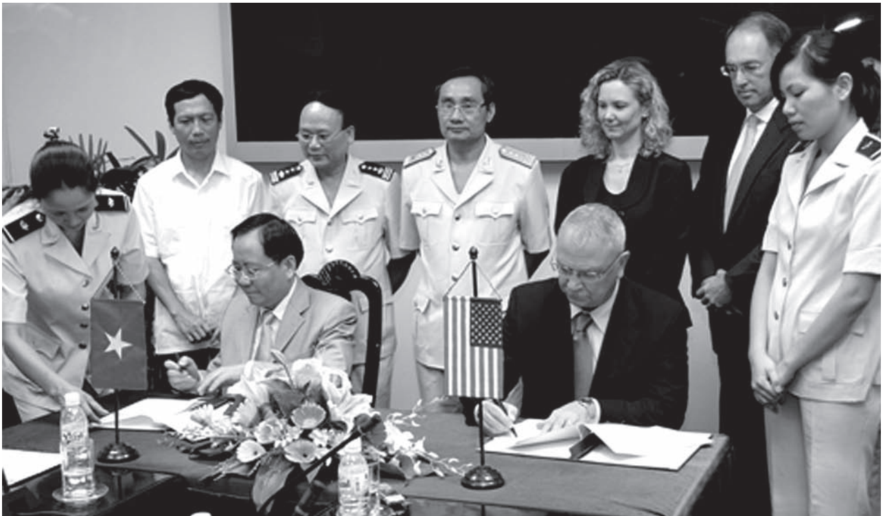
Government of Vietnam