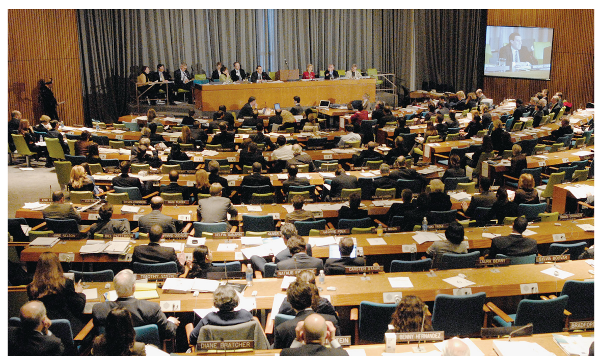
On February 14, 2008, financial leaders representing $22 trillion in assets gathered at the United Nations for the third Investor Summit on Climate Risk, co-hosted by Ceres and the United Nations Foundation; the event was co-convened by nineteen foundation presidents (see last page for list of foundations).

Climate change presents enormous risks and opportunities for investors. Climate risk is now embedded in all investment portfolios as companies worldwide face far-reaching competitive risks from emerging climate regulations, threats of litigation from climate inaction and physical hazards from extreme weather events, rising sea levels, wildfires and water shortages. But where there are risks, there are also opportunities. The next 50 years will require a massive shift to cleaner energy sources and technologies to avoid unmanageable climate disruption. Investing in these low-carbon sectors is likely to bring enormous rewards.