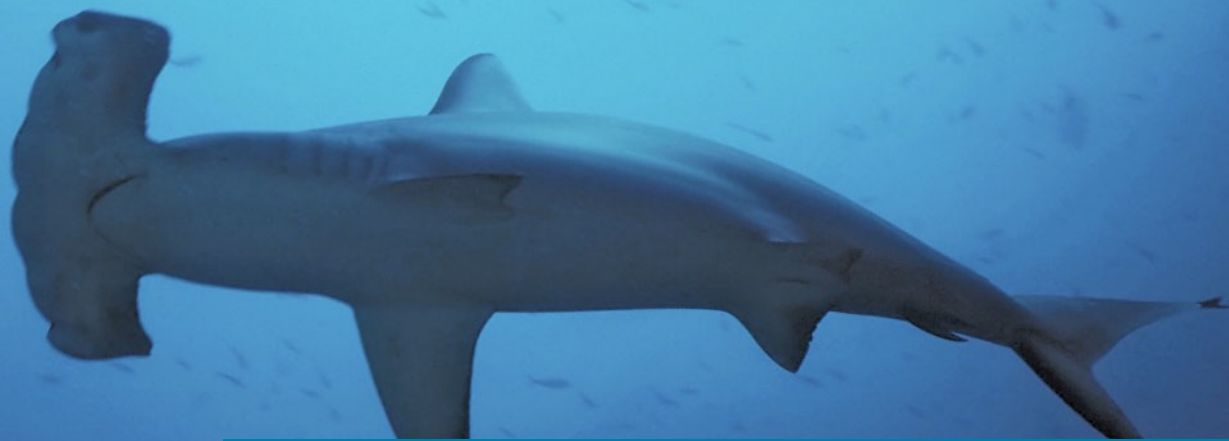
TABLE 2: PERCENT CHANGE IN SHARK ABUNDANCE AND BIOMASS OVER TIME ACROSS ALL STUDY SITES IN THE MEDITERRANEAN SEA