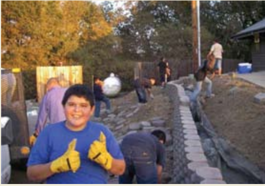
With a focus on service learning, the Galt Area Youth Coalition provides opportunities for students to take what they learn in the classroom and apply it in the community, such as the Cosumnes River Preserve Visitor Center Landscape Project, shown here.

These distinctions are particularly appropriate considerations when a foundation initiative is characterized by one or more of the following: 22