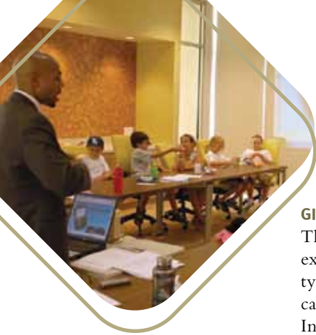
Planet Philanthropy participants listen to presentations from nonprofits.