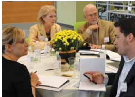
Donors at our annual Center for Family Philanthropy event.

Creating your personal philanthropic plan helps you map out your giving over time. This plan may change as your approach to philanthropy evolves, but it will hold us accountable to you and help you determine the extent to which you are meeting your goals. We develop your plan by talking about what matters most to you – your values. We then work with you to connect those values to areas of interest. We also look at your past history of giving. To what extent was your giving in alignment with your interests? Were your grants “honored obligations?”