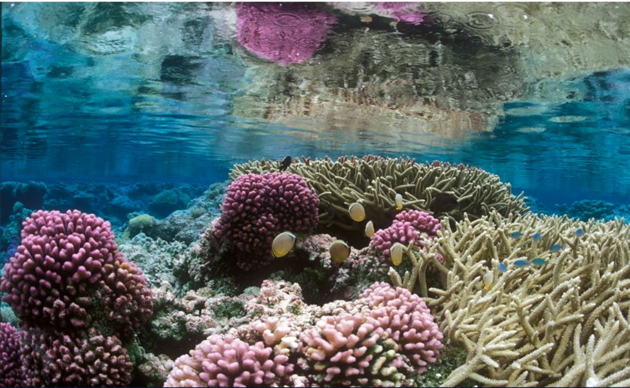
Acropora & Pocillopora corals at Palmyra Atoll in the Pacific Remote Islands Marine National Monument.