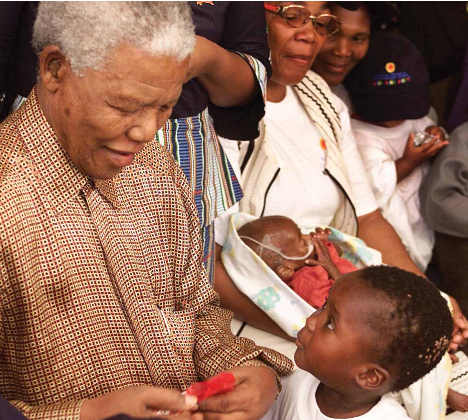
Crossroads, Cape Town, 2007: former state president Nelson Mandela engages with HIV-positive children