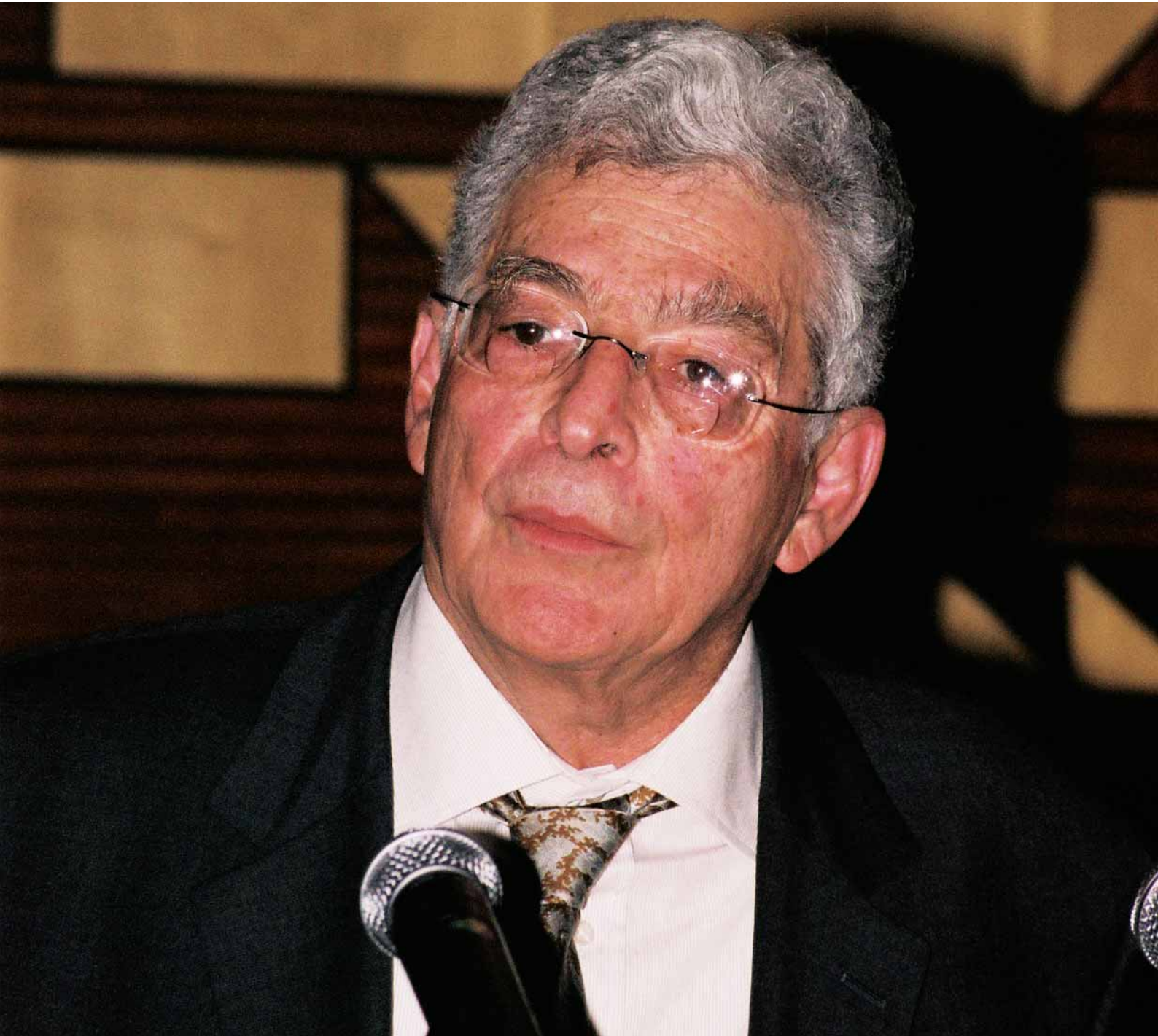
Former Chief Justice of South Africa, Arthur Chaskalson, who stepped down in 2005 and who presided over some of the Constitutional Court's most path-breaking judgments