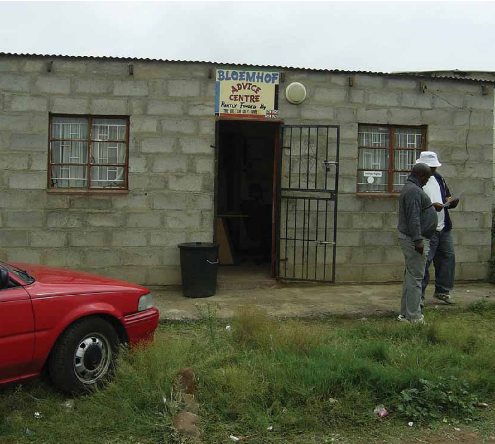
2007: Bloemhof, North West province: an advice office affiliated to the Association of University Legal Aid Institutions (AULAI). It serves a largely poor, rural community