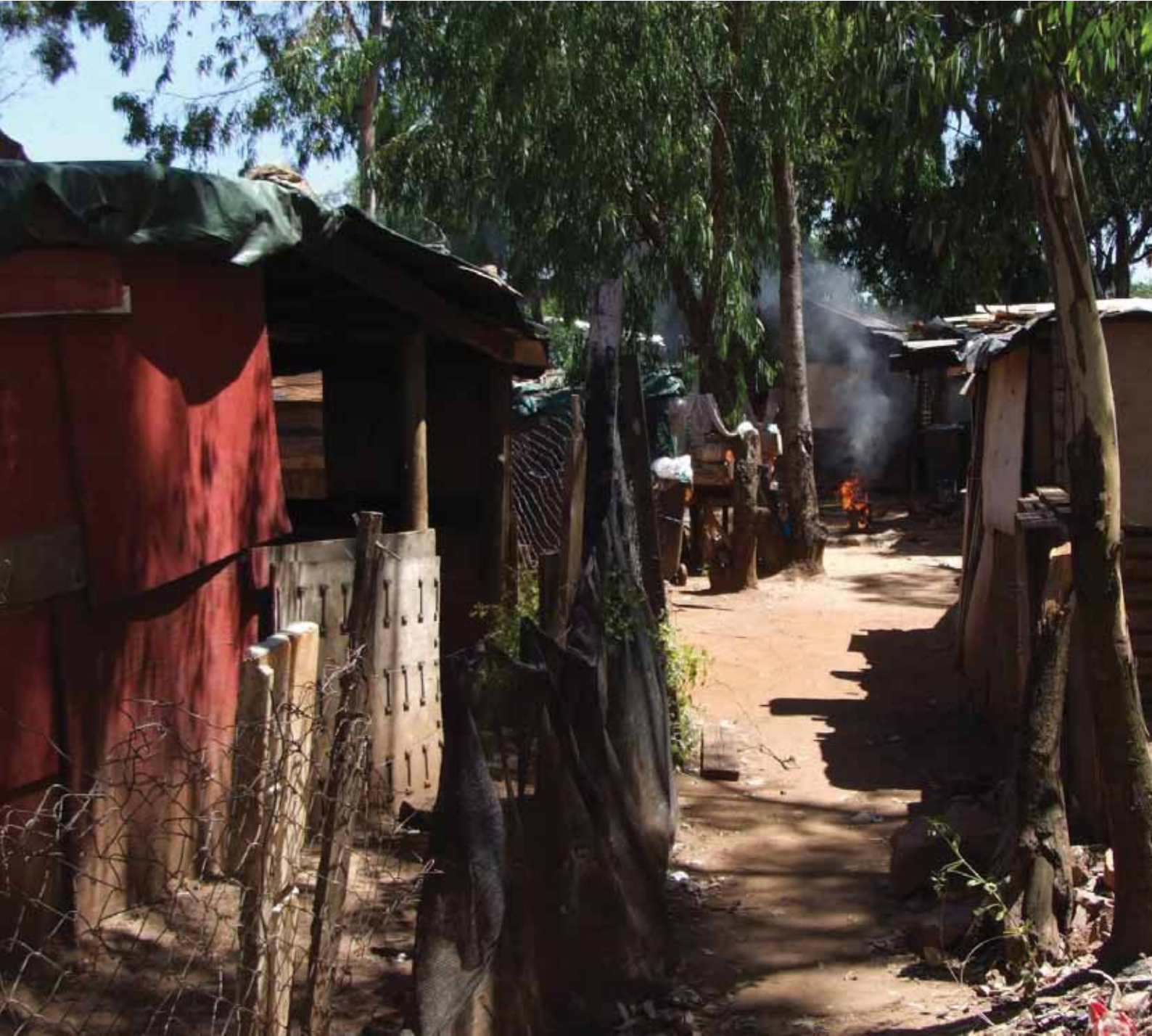
The Grootboom informal settlement today