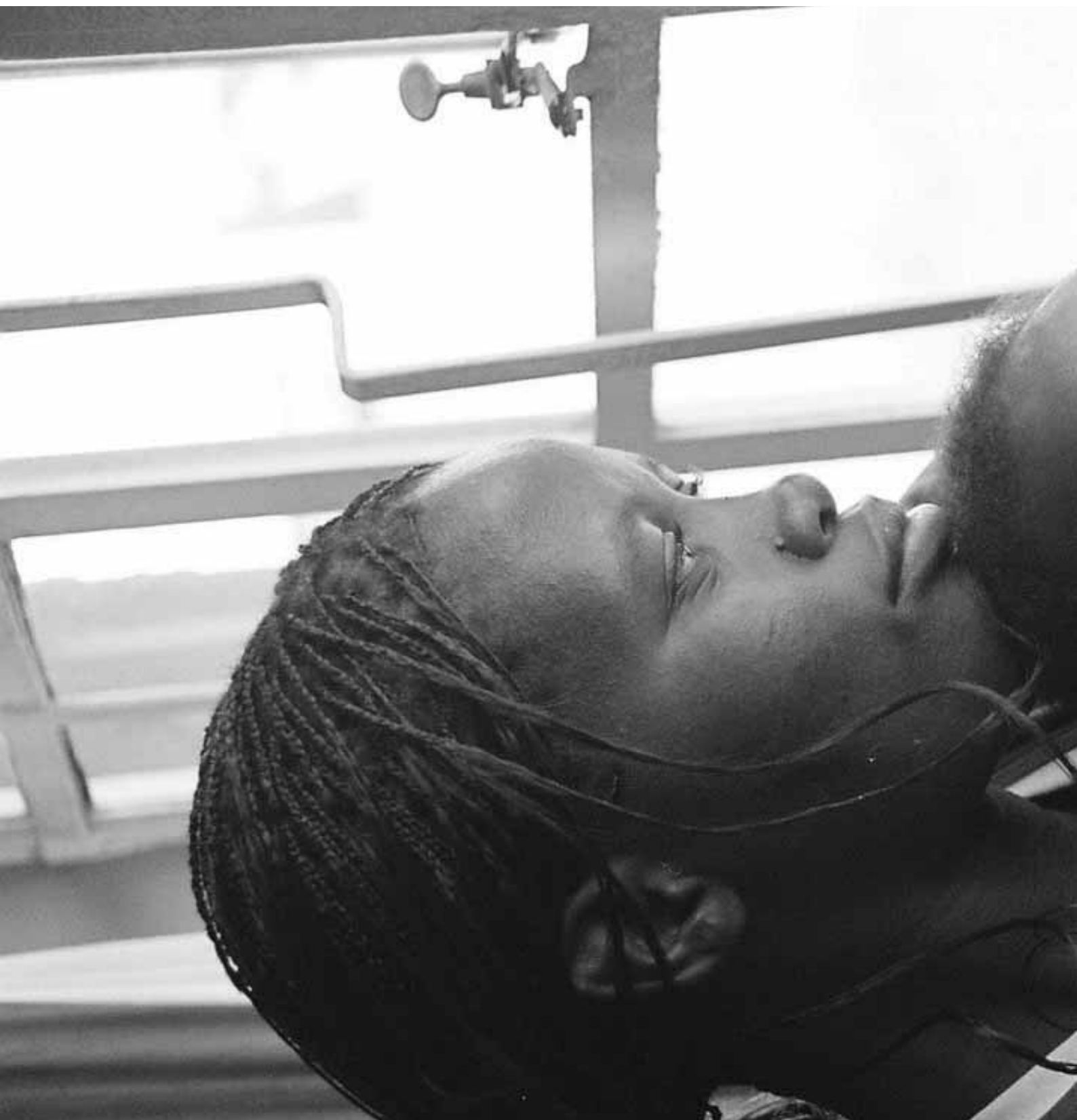
HIV positive mother and HIV negative child: provision of Nevirapine during her pregnancy prevented her child from contracting the disease while in the womb