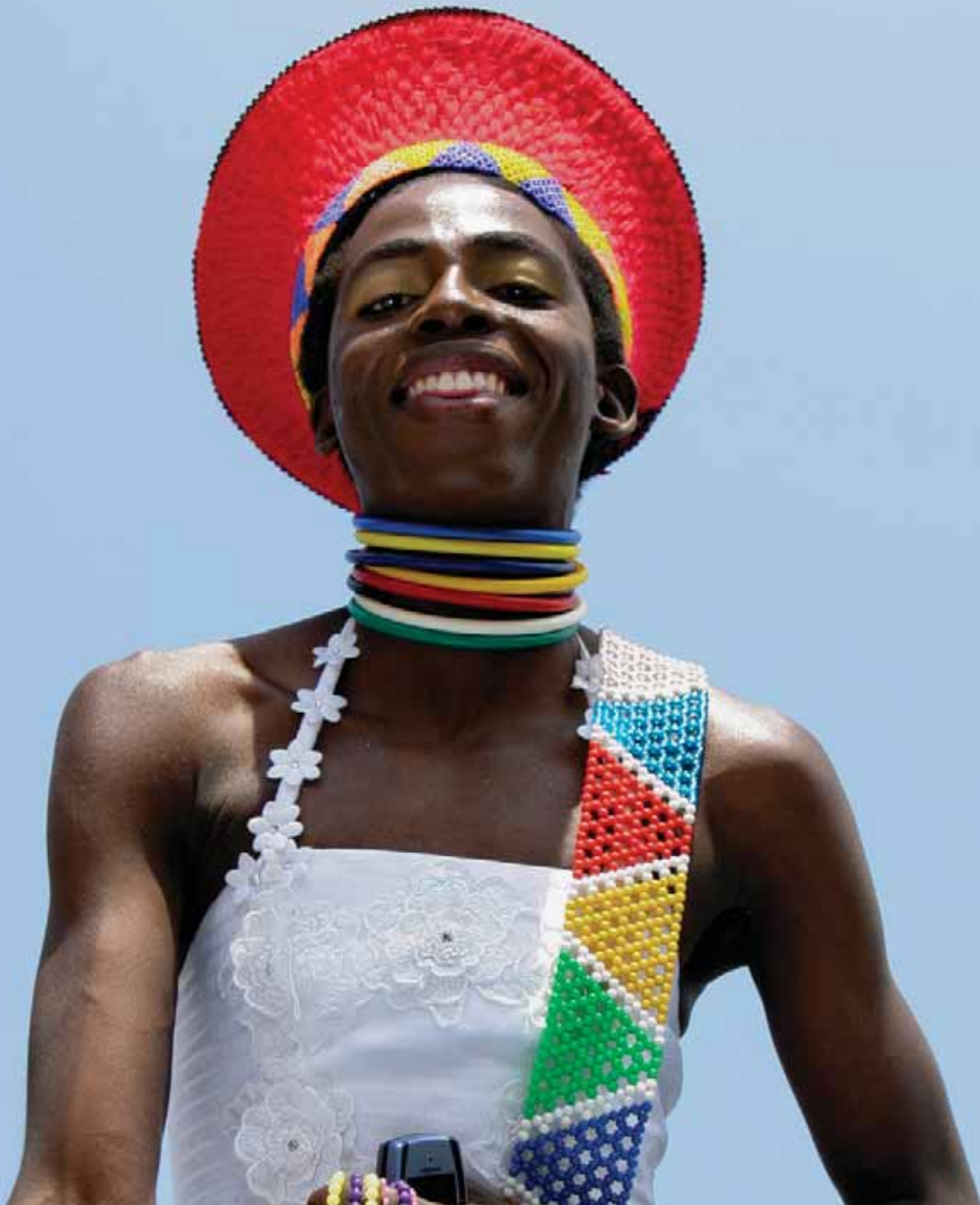
Gay Pride, Johannesburg 2007: the Constitutional Court has conferred full citizenship on the country's gay and lesbian community since the advent of democracy is a series of rulings that demolished apartheid-era criminalisation of homosexuality while also conferring new rights enshrined in the Constitution adopted in 1995