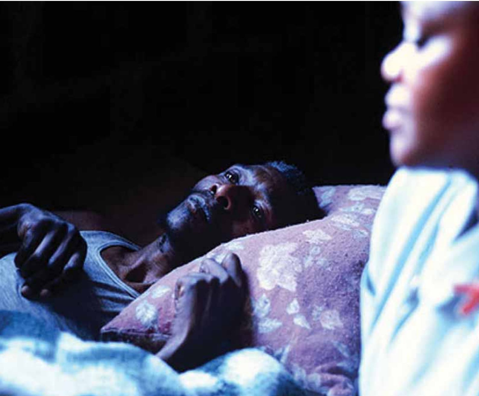
A sister of the Msunduzi Hospice comforts a man dying of AIDS at his home outside Pietermaritzburg, KwaZulu-Natal province