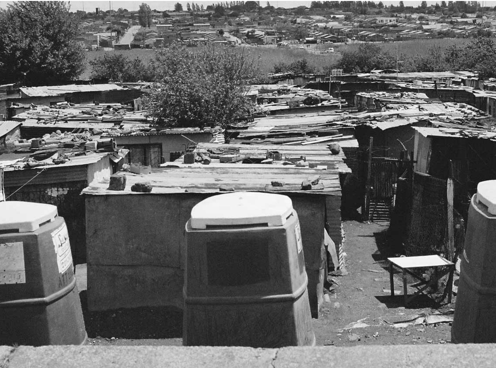
The Kliptown informal settlement, Soweto, is typical of many in South Africa, though in this one, one essential service, latrines, has been provided