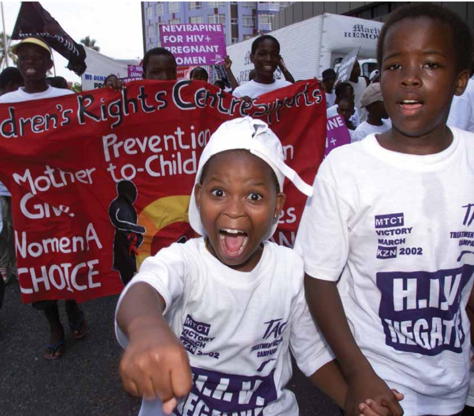
Durban, March 2002: a demonstration was organised by the Treatment Action Campaign demanding that HIV-positive mothers be treated with the highly effective anti-AIDS drug, Nevirapine, to prevent the virus being passed on to their unborn children