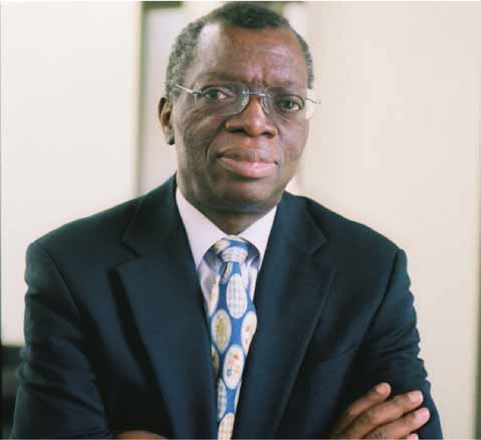
Current Chief Justice of South Africa, Pius Langa