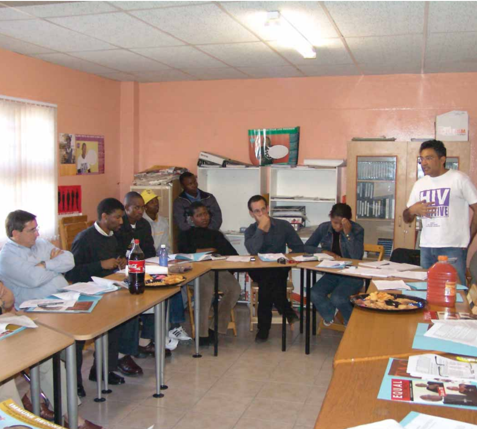
September, 2006: Trustees of The Atlantic Philanthropies visit the Western Cape regional offices of the Treatment Action Campaign in Khayelitsha