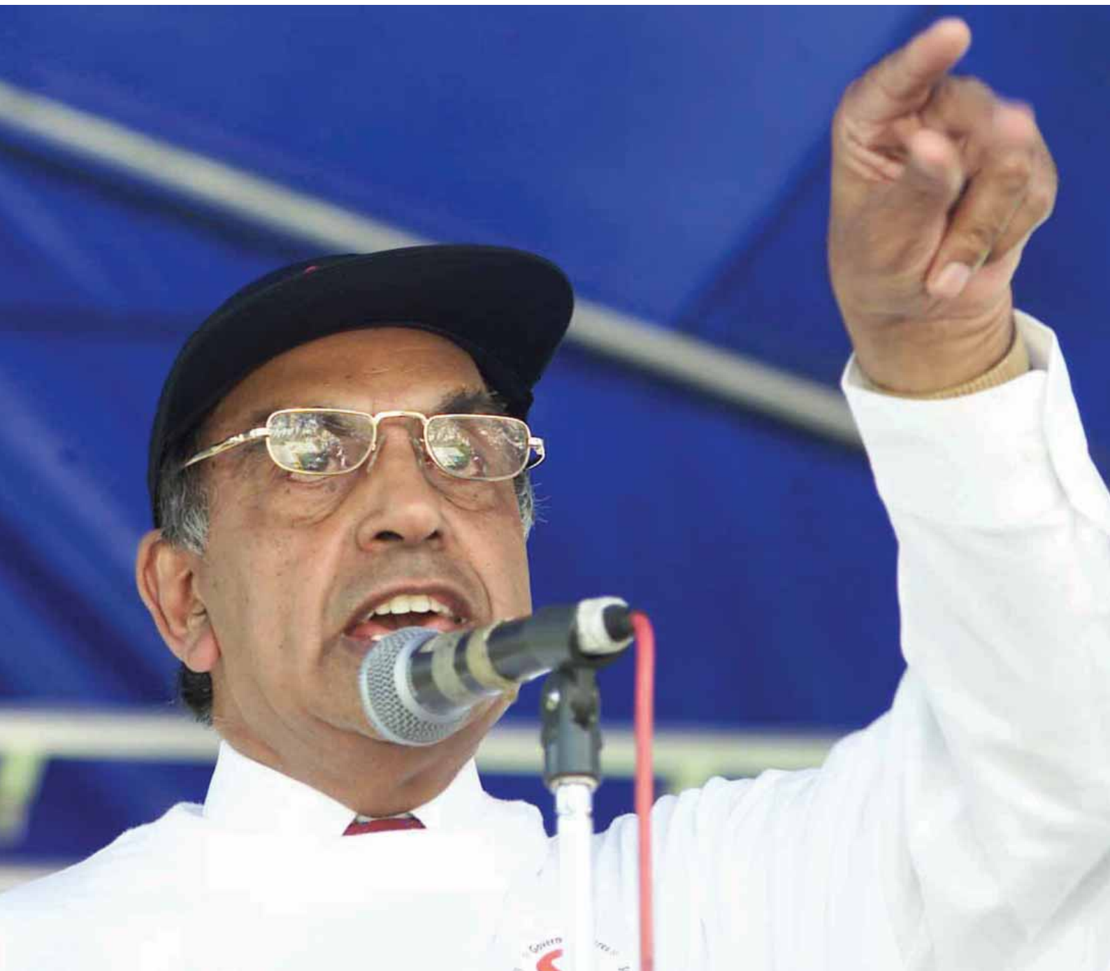
2000: The late Minister of Justice Dullar Omar opposed the decriminalisation of sodomy, forcing the National Coalition for Gay and Lesbian Equality to go to the Constitutional Court. The court ruled against the government in 1998