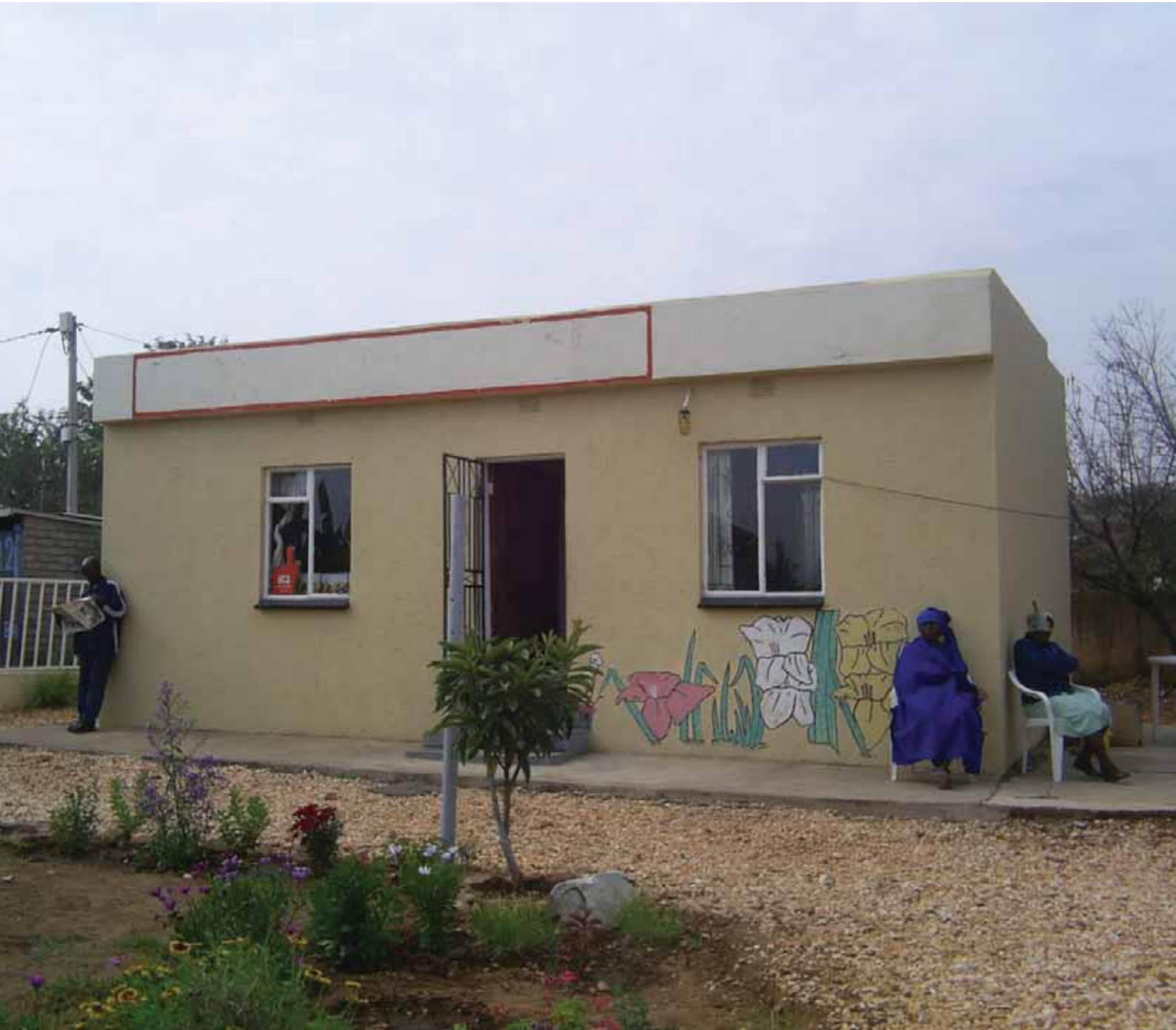
2007: North West province: a rural legal advice office affiliated to the Association of University Legal Aid Institutions (AULAI)