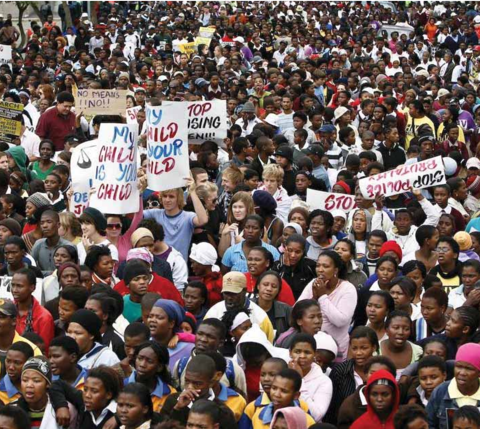
May 2008: NPOs protest against gender-related violence and child abuse outside Parliament and call for tougher implementation of legislation on children's rights