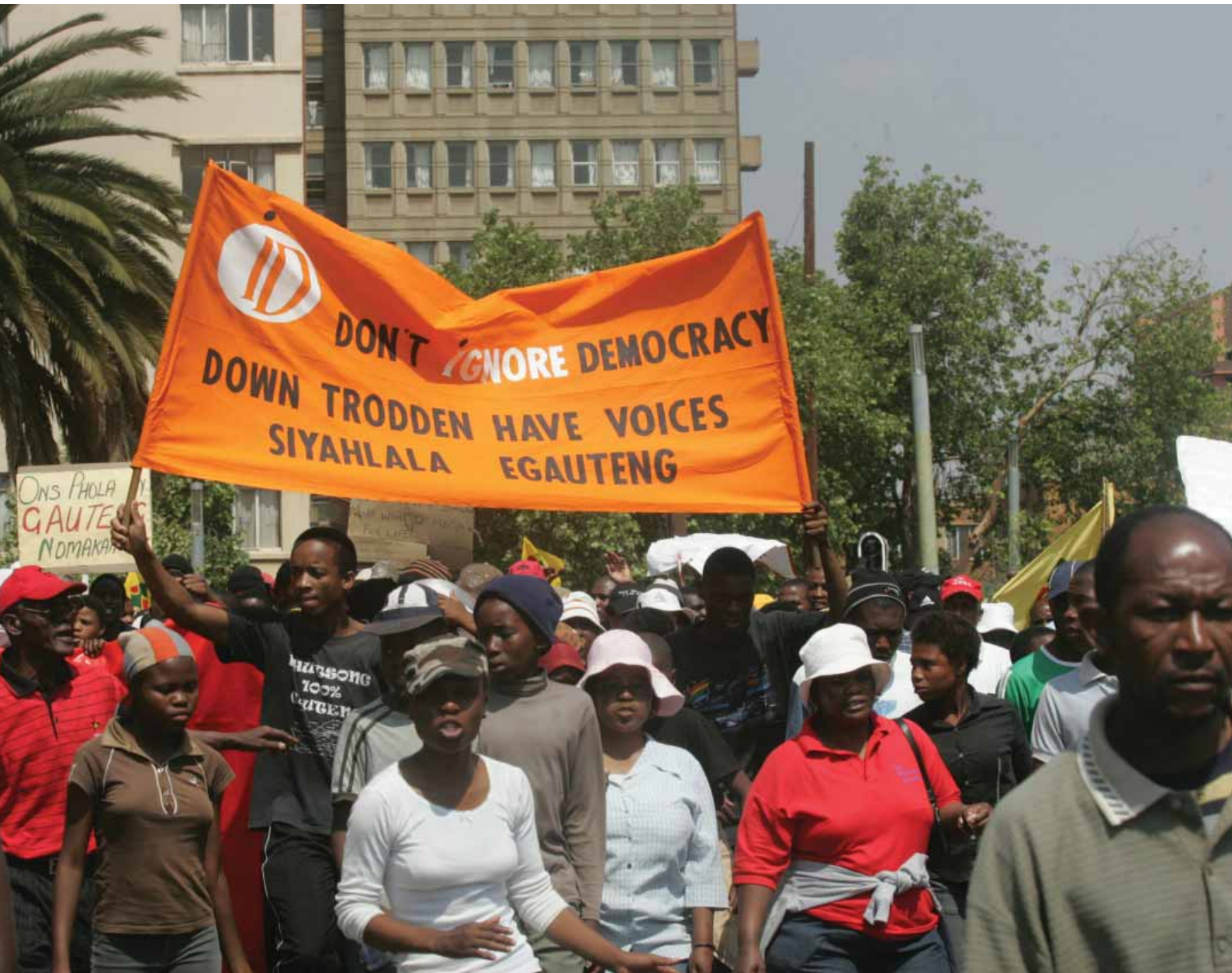
September 2007: residents from Khutsong, Gauteng province demonstrate outside the Constitutional Court against the government's re-zoning of their community into the much poorer province of North West. The community feared deterioration of the quality of municipal services. On the 13 June 2008, the court ruled against them on their petition to remain part of Gauteng