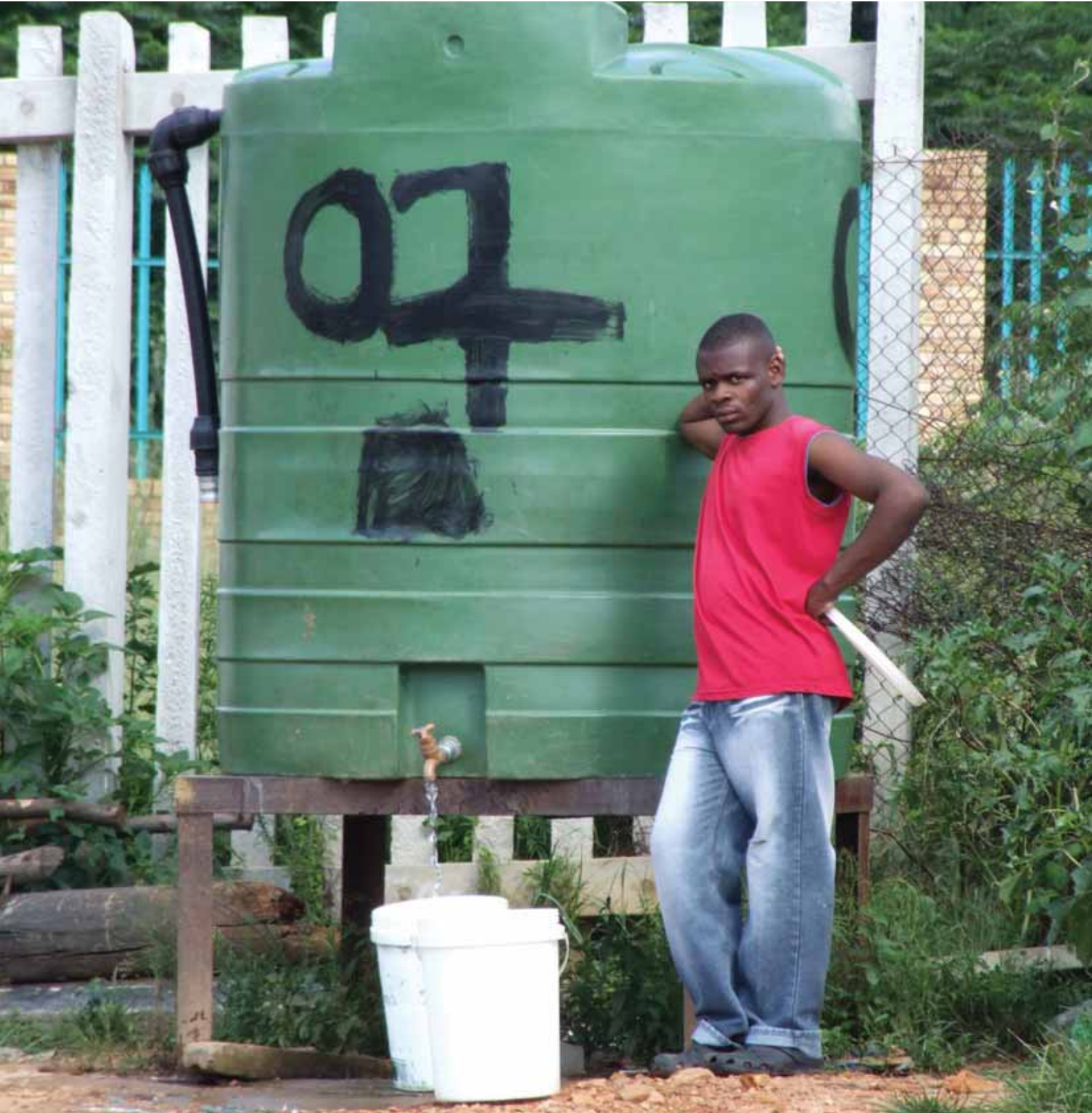
2007: Action by civil society, including the use of litigation, has seen essential services provided to the poor in informal settlements – here potable water is available to residents of the Grootboom informal settlement, near Cape Town