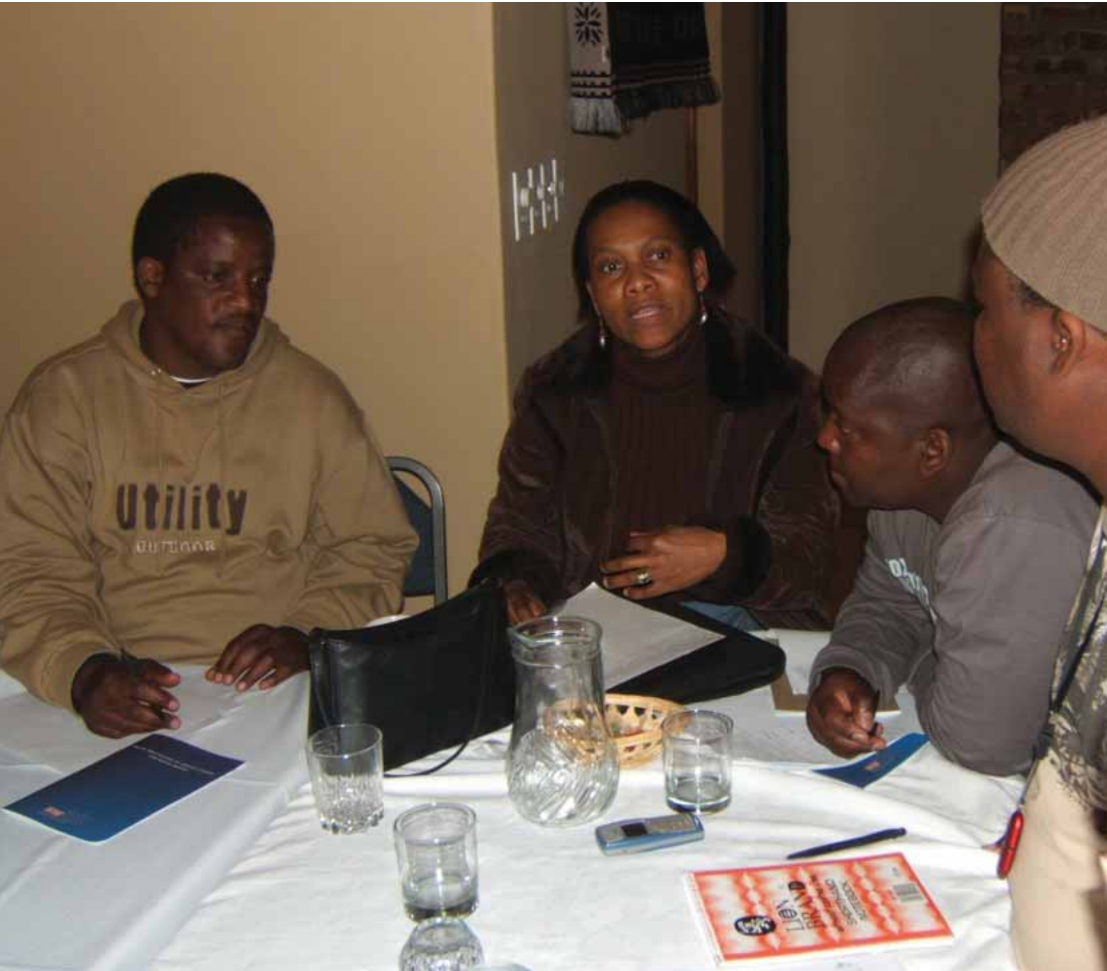
2007: Para-legal advice officers affiliated to the Association of University Legal Aid Institutions (AULAI) attend a training workshop to update their knowledge of new legislation