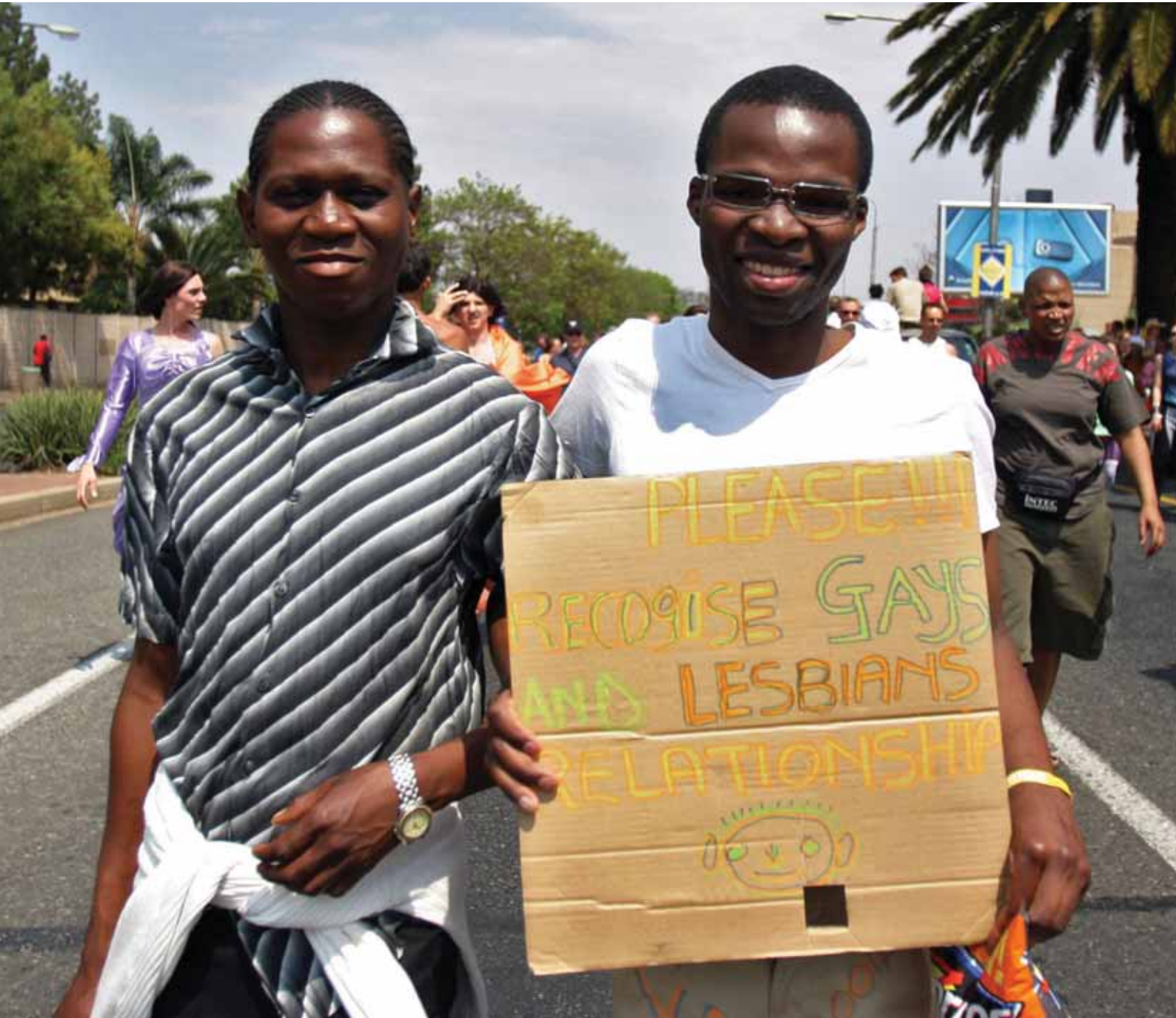
2007: Demonstration in favour of gay marriage: after a protracted campaign by LGBTI groups, Parliament voted the Civil Unions Bill into law, in December 2007, recognising same-sex marriages and giving legal force to the Constitutional Court ruling