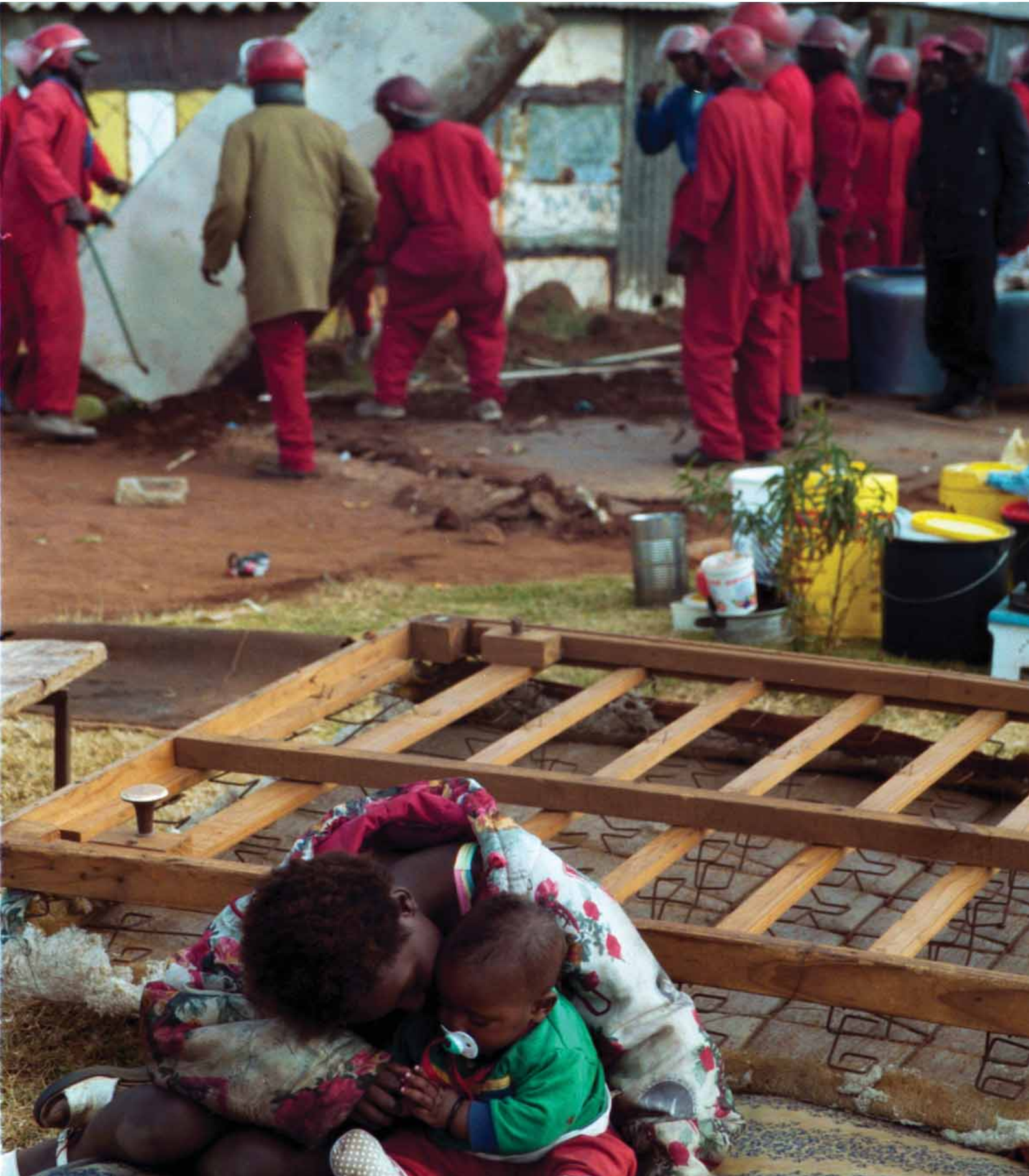
2003: Eldorado Park, near Johannesburg: “Red Ants”, guards hired by the municipal authorities, break down shelters and evict residents from an “illegal” informal settlement