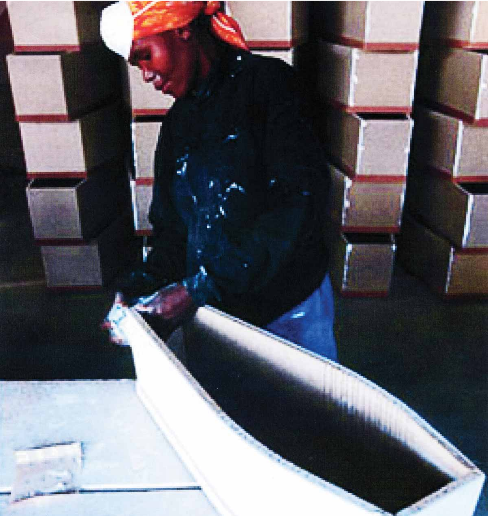
The coffin industry has boomed in South Africa since the advent of the HIV/AIDS pandemic in the late 1980s. There are more than a thousand deaths a day and in 2008 a quarter of the population is infected with HIV