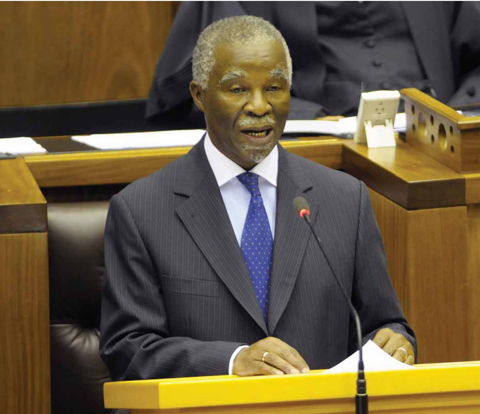
February 2008: President Thabo Mbeki opens Parliament in Cape Town. Mbeki's AIDS denialism has held up the public health system's roll-out of ARVs to treat people with HIV/AIDS. Mbeki's stance has forced NPOs to take the government to court on numerous occasions and has contributed to the rising rate of deaths from AIDS