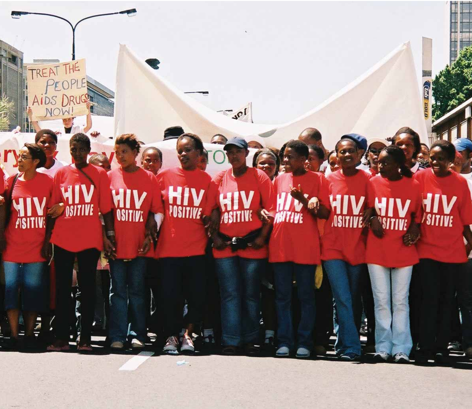
Cape Town, 2007: A Treatment Action Campaign demonstration: the TAC has held the government's feet to the fire, through a combination of on-the-ground mobilisation, innovative advocacy and litigation