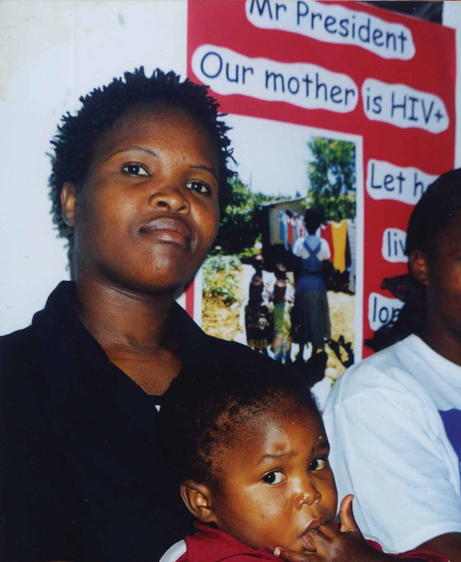
HIV positive mother and child