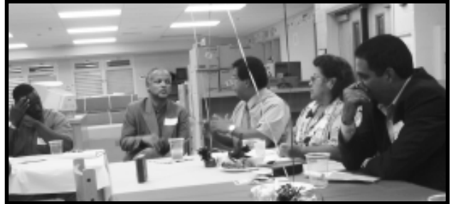
Focus conversation in Del Ray, Florida

Most of the interviewees had strong messages for philanthropy, mainly regarding the scope of investment in leadership, the flexibility of available resources, and the composition of the leadership within philanthropic institutions. Ultimately, this interview process proved to be a dialogue about power—understanding it, using it, and changing the rules to ensure its more equitable distribution.