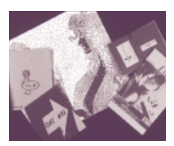
Special publications are targeted specifically to young people.