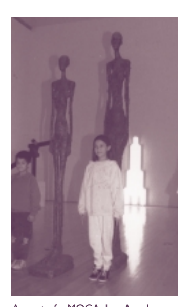
As part of a MOCA, Los Angeles effort to attract more young people and their families to the museum, students stand with artist Alberto Giacometti's Tall Figure II and Tall Figure III .

Nearly three years ago, the Museum of Contemporary Art, Los Angeles (MOCA) resolved to make the museum a regular destination for parents and children. Until then, it was mostly attracting single, affluent, childless visitors. Exploring the range of available options, the museum devised a three-prong strategy: Find ways to display and interpret its extensive permanent collection of post-1940s art so it would appeal to families; enlist artists whose works are on display to design special installations and participate in public workshops; and reach out directly to schools and family organizations.