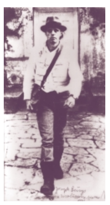
The work of artist Joseph Beuys, depicted above in this self portrait from the Walker's permanent collection, has influenced a variety of museum activities. One of these is a project that included the planting of more than 1,000 trees—inspired by Beuy's 7,000 Oaks project in Germany.