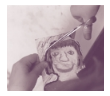
Weaving Tales, a Free First Saturday activity, demonstrates self expression through collage making.