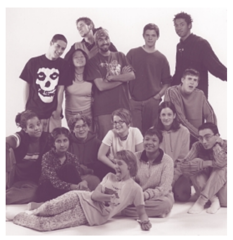
The Walker's Teen Arts Council has successfully attracted young people to the museum.

Now a permanent museum program, the Teen Arts Council has fulfilled its goals of increasing attendance and deepening participation of a broad range of young people at the Walker. Participants' commitment to the Walker is evident at the Teen Program's annual alumni holiday party. According to Moss, alumni return as college students and even graduates, "girding hopes that art, and maybe even the Walker, will continue to hold a place in their lives."