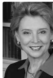
Washington State governor Christine Gregoire

“We are trying to drive up quality and safety while driving down cost. Proper staffing is an absolute key.”