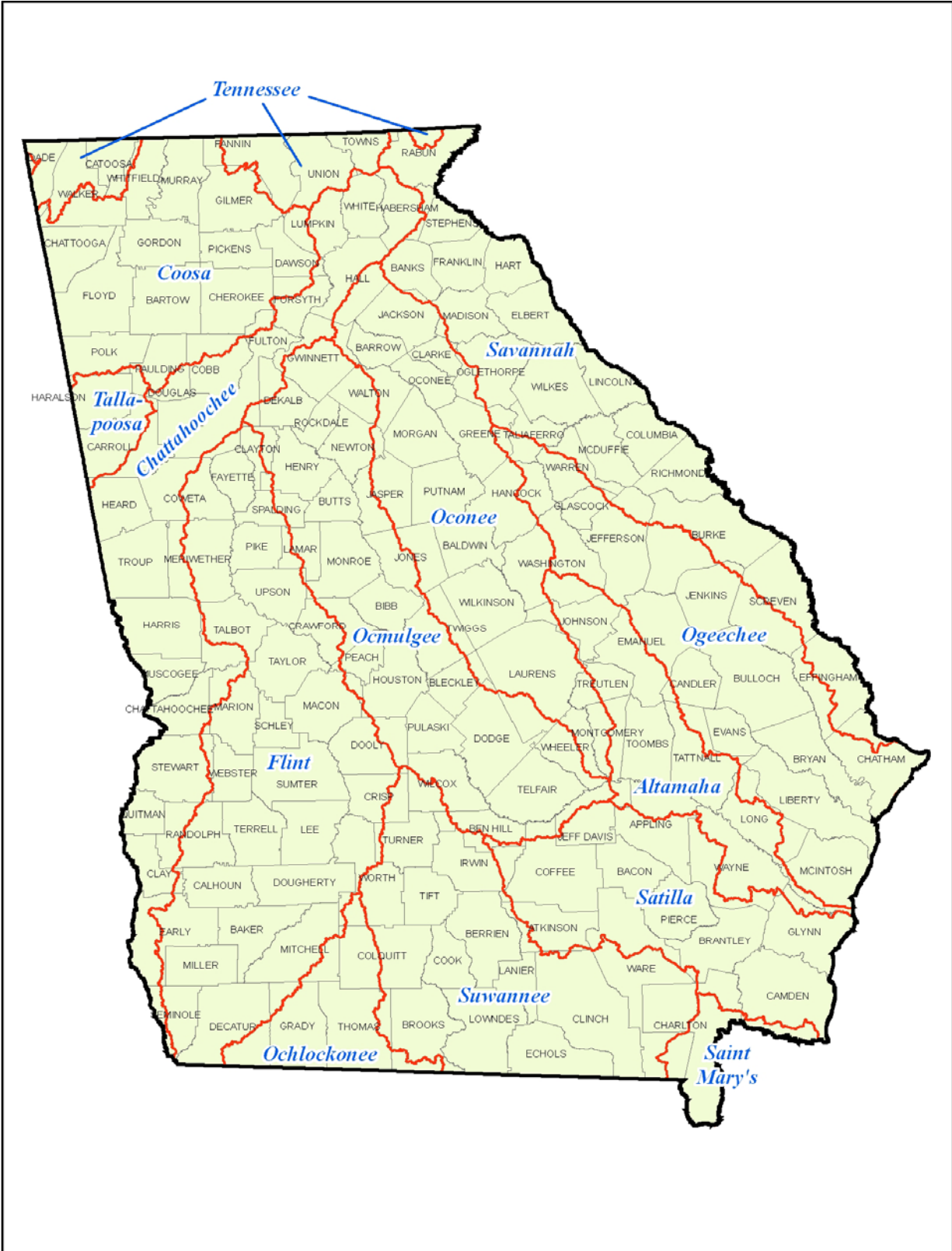
FIGURE 2: Georgia's 14 Major River Basins