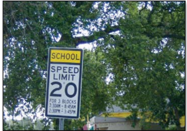
Speed limit sign near Drew Elementary

Drew Elementary is situated on State Highway 46, which creates a physical barrier from the neighborhood due to high traffic volumes and speeds.