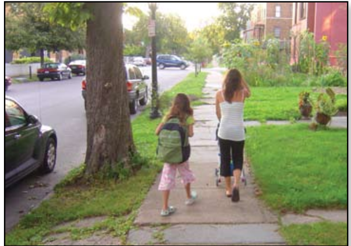
Walking to Hamlin Park School

The Hamlin Park community is also part of the "Neighborhood of Choice" program. This program was established by the City of Buffalo to facilitate the revitalization of the Hamlin