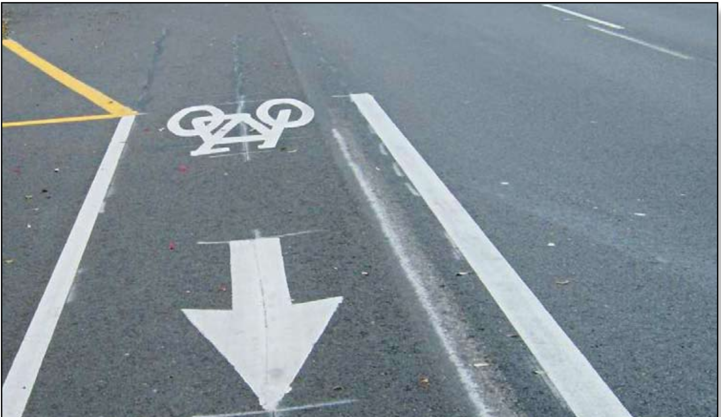
New Orleans first-ever bike lane leads to Drew Elementary

install bike lanes and high-profile crosswalks, and to upgrade curb ramps on these roadways, including along the newly-paved state highway. The State Highway 46 project was completed in July 2008 at a cost of approximately $93,630 for bike lanes and crosswalks, and $18,900 for 42 curb ramp upgrades, funded through the state highway maintenance fund. The bike lanes on St. Claude Avenue (State Highway 46) were the first bike lanes to be installed in the City of New Orleans. The State of Louisiana has now incorporated the new bicycle lanes and crosswalks into its standard operating procedure for the highway.