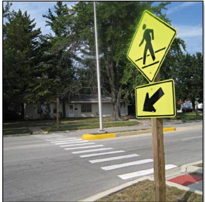
This sign will be replaced by a new 'School Zone' sign

During the summer and fall of 2008 educational activities included open houses at elementary schools where safety information was given to parents including instructions on how to request adult crossing guards for their schools. In addition, new traffic patterns were presented to the parents and families to improve safety during arrival and departure periods. Other activities included Market at the Square – a traffic safety game, C-U bicycle maps, a bicycle rodeo, and bicycle helmets fitted and given away. The C-U SRTS Project also hosted Walk and Bike to School Day at 12 elementary schools, handed out safety