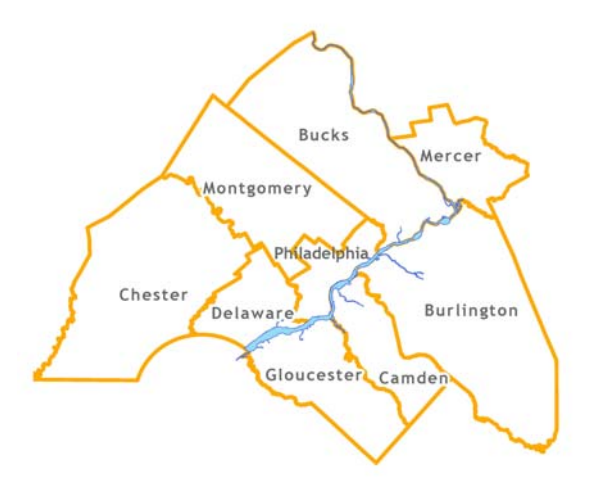
Figure 3: DVRPC Region

New Jersey anticipates starting to update its plan in 2009. The lead administrative agency is the Bureau of Safety Programs within NJDOT. The 2007 plan was guided by a New Jersey Safety Management Task Force and had technical support from the Rutgers University Transportation Safety Resource Center (TSRC). The TSRC will provide technical support for the update of the New Jersey plan as well.