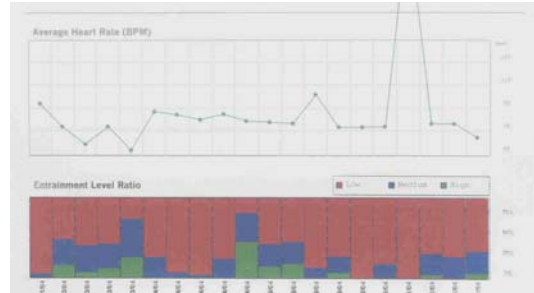
Figure 2. Sessions 6–9

Figure 2 (treatment sessions 6 through 9) shows a move towards increased coherence. Overall, the boy's average heart rate has dropped considerably, although there is still one session in which he displays an extremely high heart rate. In about three-quarters of the sessions shown, he is now able to achieve between 25–75% medium to high coherence; and his ratio of high heart rhythm coherence (green segments) has also increased.