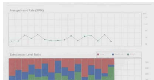
Figure 3. Sessions 10–12

Finally, in Figure 3 (treatment sessions 10 through 12) we see that this child's average heart rate has decreased even further and has become very stable from session to session (note that there are no extreme spikes in this record). His ability to generate medium to high heart rhythm coherence has increased substantially, indicating increased nervous system stabilization and increased synchronization and harmony in the activity of the heart, brain, and other bodily processes. Of particular note is the fact that this child had a cardiac arrhythmia at the beginning of the training program, which was no longer present at the end of the sessions; this was confirmed by cardiologist Dr. Hector Briseño.