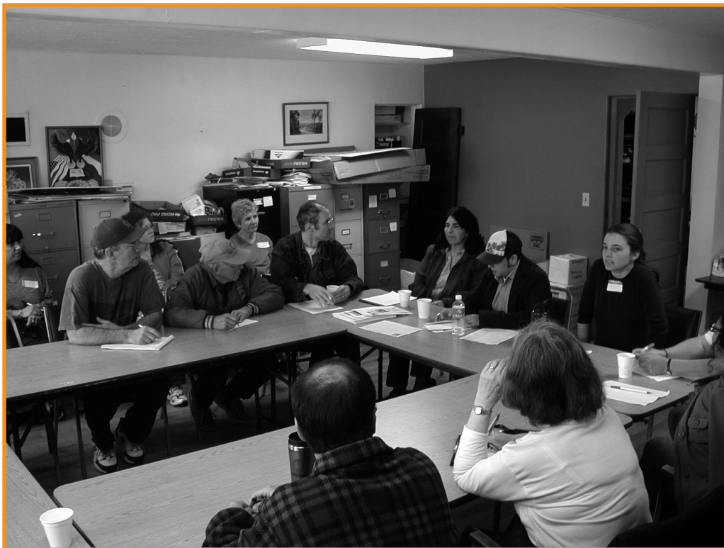
A CAUSA board meeting.