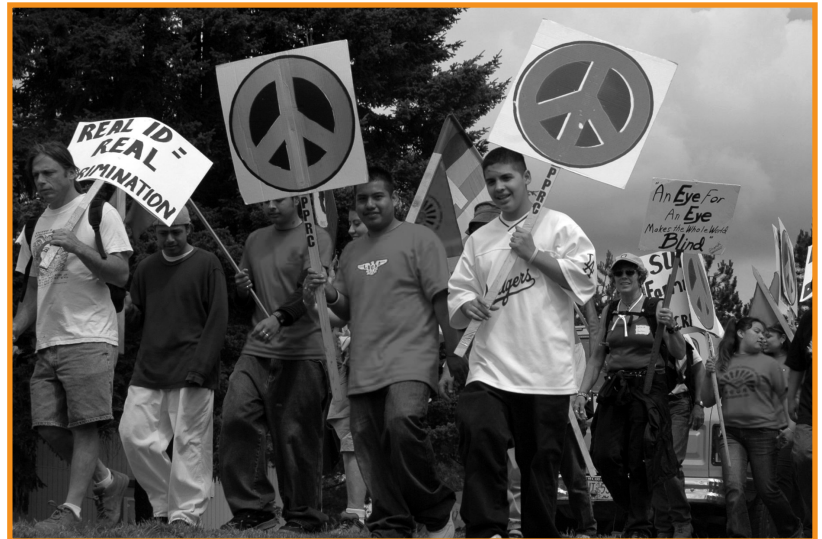
Youths lead on day four of the 200 Walk for Truth, Justice, and Community in Woodburn, Oregon.

“One of the things that stood out the most was that they (the gay and lesbian community) were marching throughout the valley, and we were one of the only groups to welcome them. They told us the story that they were allowed to stay in a church. I’m not sure where, maybe in Junction City. The pastor just gave them the key and said, ‘Make sure it’s cleaned up.’ Then he left—like not wanting to have anything to do with them. In that context, our community was pretty much homophobic, because of the church influence, the Catholic Church influence, among other things. We decided we needed to support the LGBT [lesbian, gay, bisexual, transsexual] community, and we needed to defeat Measure 9 because Measure 9 was clearly an attack on the gay community.”