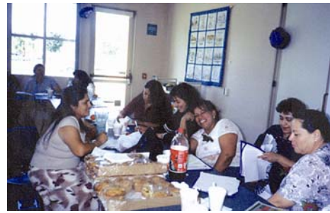
Educational Meeting.