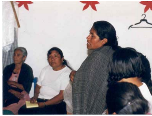
Indigenous women organizing.