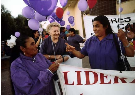
Domestic Violence March