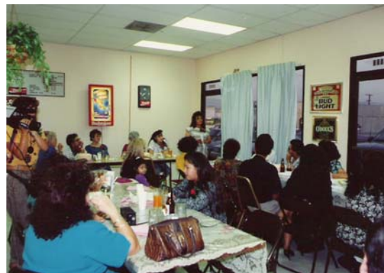
Installation of Officers of Mujeres Mexicanas (1991), Archives of Mujeres Mexicanas

Central to this chronicle is how really listening to the campesinas’ life stories, dreams, and strategies for social justice changed the interviewers; here is the seed of the story of how Líderes Campesinas emerged out of a needs assessment study. Pivotal to the Líderes Campesinas story is how the early participants developed a leadership model and practice out of the idea that it was not enough to study the needs of campesinas, if women did not organize themselves to address those needs. As they began listening to the women who shared their stories of how they dealt with their problems, they heard study participants say that they were tired of being questioned, used by researchers and social service agencies that did not represent their own concerns and their problems,