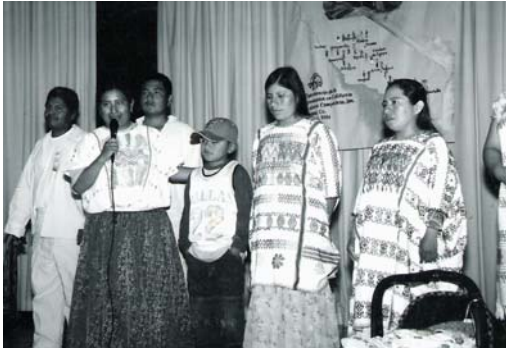
Indigenous Members at Líderes Campesinas' Convivencia 2004