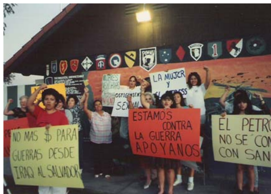
Mujeres Mexicanas & Mujercitas Mexicanas demonstrating against the "Storm" in 1991

Through the words and actions of the interviewees, the original members of Mujeres Mexicanas noted a new model of leadership by in the way the women reflected on possible solutions to their problems. When asked to identify the issues they would like to see addressed (in this case in the form of a radio show), the participants in the study identified the need to receive information about their rights and about community services available to them. They did not want more experts coming to their community and they continued to see little change in a situation where they lacked opportunities and respect for their basic dignity and human rights. The interviewers discovered that leaders must not only respond by listening but must believe that the women themselves are capable of shaping their own lives and destinies. By learning about their histories and gaining new tools and access to available options, campesina women are better able to confront the issues and conditions that limit their life possibilities.