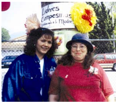
Coachella members preparing to present a drama

domestic violence, and reproductive health issues. Some skits cover multiple topics. Working through the drama of skits or teatro, the issues they teach become more tangible when placed in the lived context of the women's lives in a member's house, at an educational meeting or community conference. For example, the members create scenarios in Spanish about domestic violence, teen pregnancy, or sexual harassment. Instead of an abstract construct, the subtle power relationships and forms of abuse become visible through skits, and audience members often recognize patterns of behavior in their own lives and identify with the performers. Teatro is then followed with presentations and discussion on sexuality, taboos, and the cycle of domestic violence, sexual harassment law, or information about pesticide exposure as well as community resources. Identifying and publicly discussing one kind of abuse often makes it easier to talk about other forms of abuse.