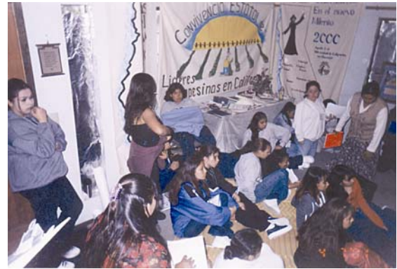
Photo of youth organizers of Líderes Campesinas