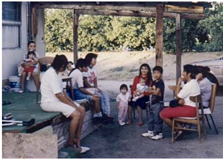
Educational Meeting. Líderes Campesinas' Archives