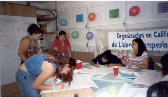
Photo of youth organizers of Líderes Campesinas

roles as mothers and utilize the cultural context of this role to anchor children in this transformative work. Many girls who are nieces, daughters, and granddaughters of members are drawing strength from the leadership they see in the members of Líderes Campesinas.