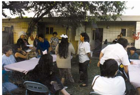
Educational Meeting.