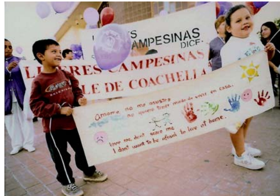
Domestic Violence Campaign – “Children have a voice”