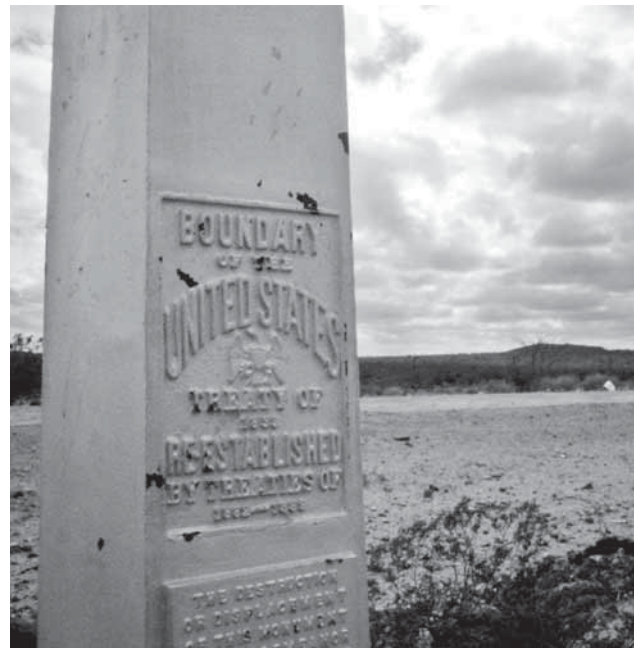
A stone monument marking the U.S.-Mexico border near Columbus, N.M. New Mexico shares some 180 miles of border with Mexico, much of it marked by just a few strands of barbed wire and manned by a couple of cameras, some underground sensors and several hundred agents.

Access to Services – Advocates for immigrant victims of domestic violence worked with government agencies to reduce barriers in receiving public benefits. Advocates also got the University of New Mexico Hospital to improve its translation and interpretation services.