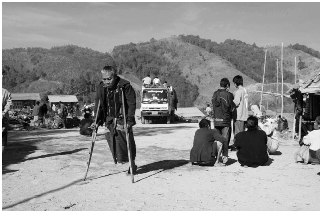
Refugees from Myanmar (Burma) at Umpien Refugee Camp, Thailand.

Almost all the refugee situations surveyed identified problems with the physical layout and infrastructure of the refugee camps or settlements, and lack of physical access for persons with disabilities. In refugee camps, refugees with disabilities noted the physical inaccessibility of shelters, food distribution points, water points, latrines and bathing areas, schools, health centers, camp offices and