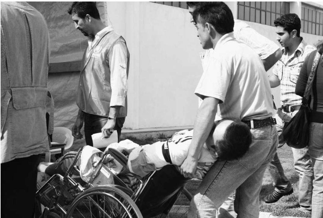
UNHCR has a dedicated registration center for Iraqi refugees located in Douma, 25 km from Damascus, Syria. A refugee injured in the war waiting at the registration center in order to receive an interview appointment.