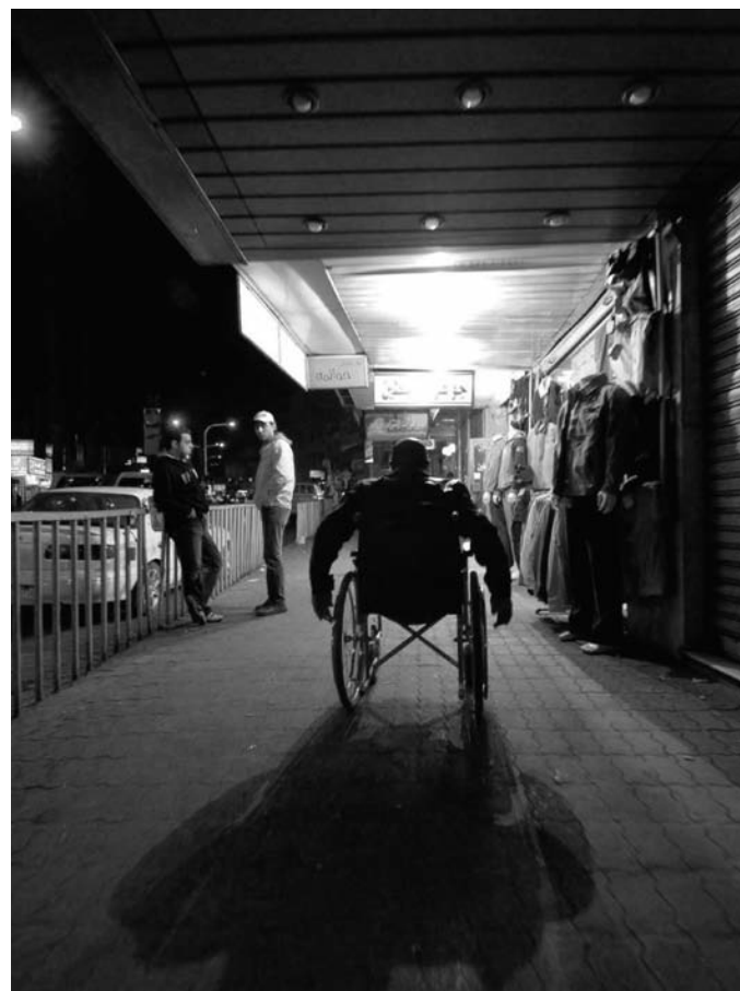
Disabled Iraqi veteran of the Iran/Iraq war in Amman, Jordan.

According to information from UNHCR, Dadaab is located in a river delta with very sandy ground. This makes it especially difficult for refugees with physical disabilities and those reliant on wheelchairs to move around the camps. In response to this challenge,