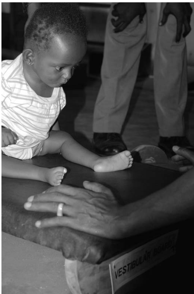
Child being treated at International Rescue Committee Physical Therapy Unit, Kakuma Camp, Kenya.

to be involved in camp management structures, even in those places where there were high levels of disability awareness.