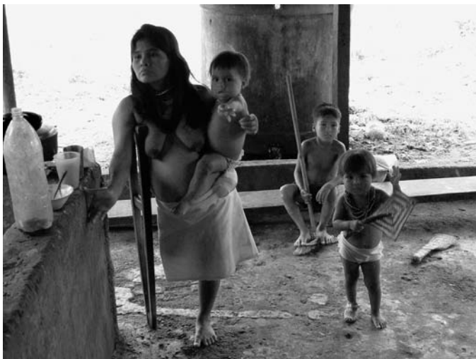
Many indigenous people in Colombia fall victims to land mines while trying to flee their homes in search of safety.

In general, it is harder for humanitarian agencies to implement refugee assistance programs in urban areas not only due to the dispersed and hidden nature of the community, but also because of government restrictions. With urgent needs in the community at large, restricted access and limited resources, the needs of refugees with disabilities are often neglected by humanitarian organizations in urban refugee programs, and there are few targeted programs for urban refugees with disabilities.