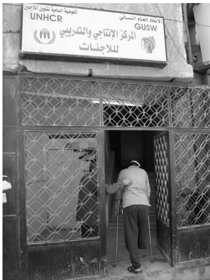
A disabled Iraqi man entering a vocational training center funded by UNHCR in Damascus, Syria.

In some countries, UNHCR, the government and partner organizations have coordinated effectively to gather data on the number and profile of refugees with disabilities in the camps. A comprehensive data collection exercise was carried out in the Dadaab refugee camps in September 2007, for example, providing very detailed information on the numbers and types of disabilities in the camps and on the immediate needs of people living with disabilities. 44