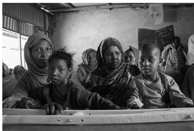
Local NGO CCBRS, Comprehensive Community Based Rehabilitation Somaliland, in partnership with UNHCR, provides physical therapy to the disabled as well as sexual and gender-based violence counseling in Hargeisa IDP settlement, Somalia.

The IASC Guidelines on Mental Health and Psychosocial Support in Emergency Settings provide a framework for understanding mental health and psychosocial problems in emergencies that is also useful when applied to persons with disabilities. 65 The guidelines state that mental health and psychosocial problems may be predominantly social or psychological in nature. Social problems may have existed before the emergency (e.g., poverty; preexisting discrimination and social exclusion). They may be emergency induced (e.g., family separation; disruption of social networks and community structures; gender-based violence) or humanitarian aid induced (e.g., undermining of community structures or traditional support mechanisms). Problems that are predominantly psychological follow the same model. They may be preexisting (e.g., severe mental disorder), emergency induced (e.g., depression and anxiety disorders, including post-traumatic stress disorder and grief) or humanitarian aid induced (e.g., anxiety due to lack of information about food distribution). The IASC Guidelines on Mental Health and Psychosocial Support identify people in the community with preexisting severe physical, neurological or mental disabilities or disorders as a subgroup that could be at increased risk of developing mental health problems in an emergency. Other at-risk groups include elderly people, especially those who have lost caregivers; people in