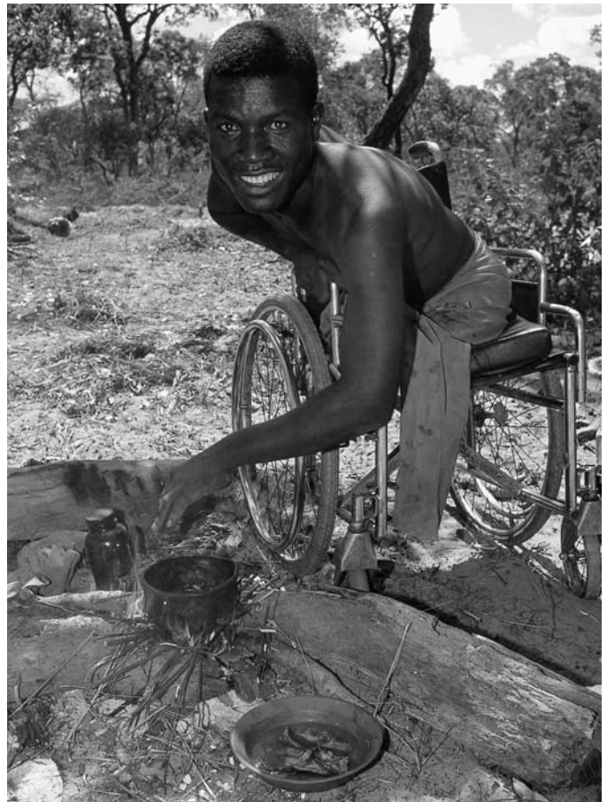
Disabled Angolan refugee in Nangweshi Camp, Zambia.

A positive example of taking the needs of persons with disabilities into account in food and nonfood distribution systems can be found in Dadaab, Kenya, where UNHCR reached an agreement with WFP that