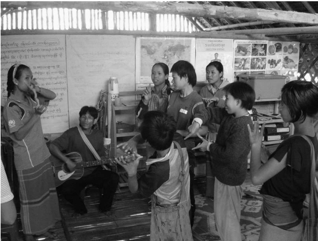
Deaf refugee children from Burma learn to sign in Thailand.

goal of integrating students into mainstream schools at the secondary level. A significant development in the refugee camps has been the documentation of Karen sign language and the dissemination of Karen Braille, which had already been created in Myanmar (formerly, Burma).