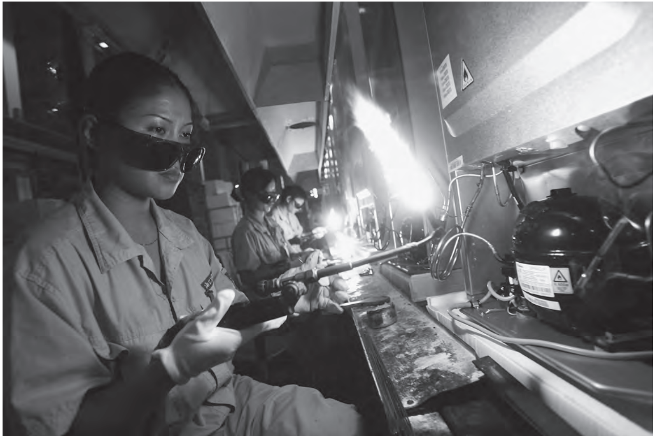
Workers at the Qingdao Haier refrigerator factory. Haier is an official sponsor of the Beijing 2008 Olympics and the world's largest producer of refrigerators.

through reference to international legal standards, already available in home-grown CSR standards.