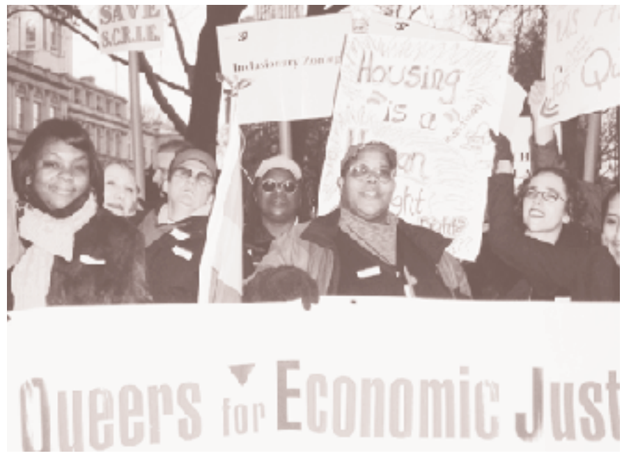
Queers for Economic Justice