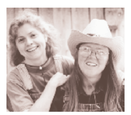
Appalachian Women's Alliance

Their work is supported by the Astraea Lesbian Foundation for Justice.