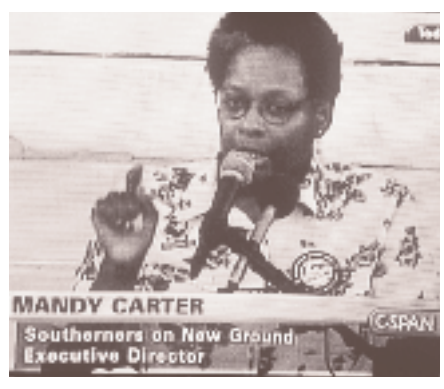
Southerners on New Ground

They are a grantee of the Pride Foundation.