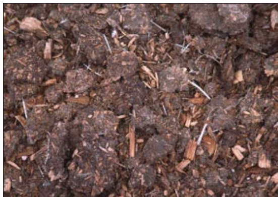
Compost containing turkey manure and wood chips from bedding material is dried and then applied to pastures for fertilizer.

arsenic but also its availability and toxicity, since the organic matter displaced arsenite more readily than arsenate.(20) In another study, kaolinite clay coated with humic acid absorbed more arsenic than did pure kaolinite clay.(21) These results seem to indicate that organic matter will enhance arsenic sorption in temperate soils but will increase arsenic solubility in highly weathered soils.