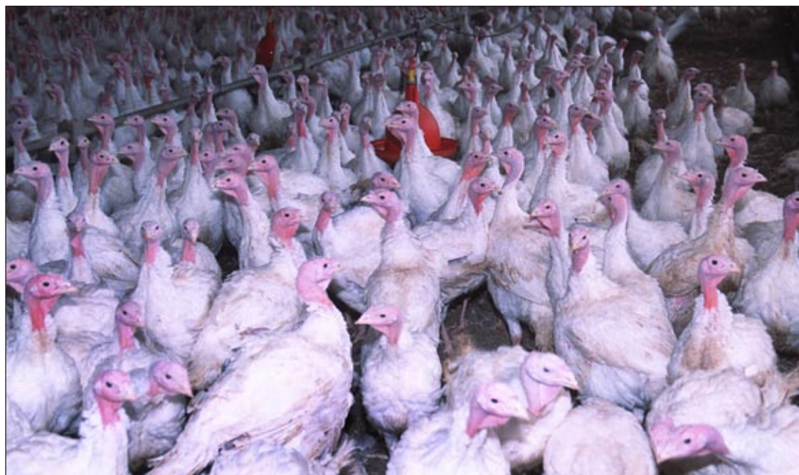
Manure and wood chips used for turkey bedding are composted and used for fertilizer on adjacent pastures.

Most of the arsenic used as an antibiotic in commercial broiler production ends up in the litter. Using this litter as a soil amendment is not prohibited by the National Organic Program, but 7CFR §205.203(c) of the Rule requires that “the producer must manage plant and animal materials to maintain or improve soil organic matter content in a manner that does not contribute to contamination of crops, soil, or water by plant nutrients, pathogenic organisms, heavy metals, or residues of prohibited substances.” Poultry litter applied at agronomic levels, using good soil conservation practices, generally will not raise arsenic concentrations sufficiently over background levels to pose environmental or human health risks. However, recent studies show that more than 70% of the arsenic in uncovered piles of poultry litter can be dissolved by rainfall and potentially leach into lakes or streams. Thus, organic producers must take care when they handle and apply poultry litter.