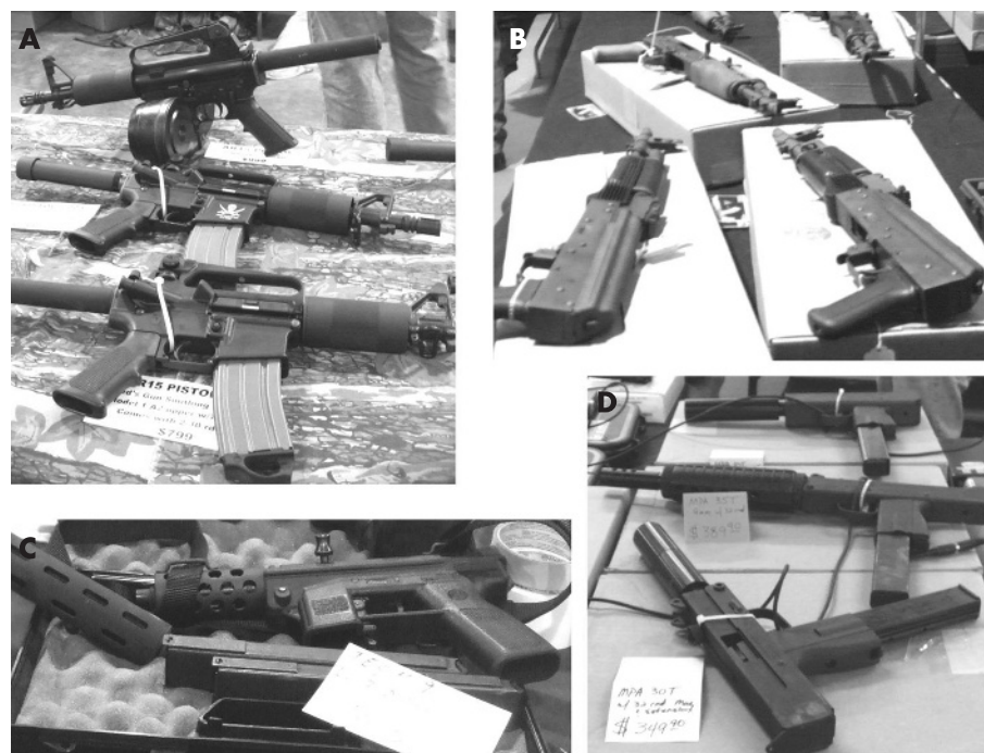
Figure 3 Examples of assault-type handguns. (A) AR15-type pistols. The gun in the rear is equipped with a 100-round magazine. (B) AK47-type pistols. (C) A TEC9 pistol. (D) MAC-type pistols.

in other states (23.4% and 4.1%, respectively, p < 0.0001 ) but not in California (11.1% and 7.1%, respectively, p = 0.61 ).