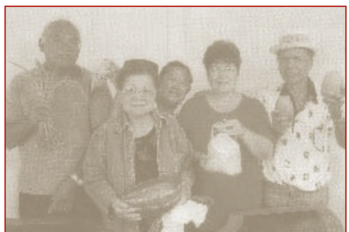
Seniors receive Kauai Fresh foods