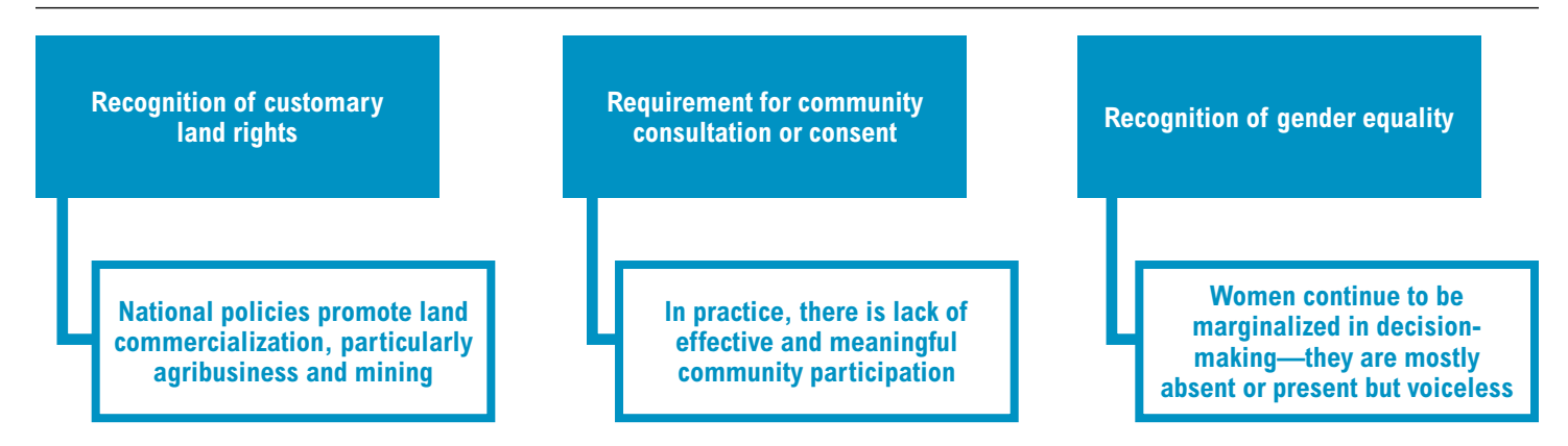
Figure 3 | Positive Elements in the Legal Framework and Caveats

The problem with gender-neutral terminology or language runs across all three project countries. The literature and project fieldwork show that generic terms in provisions relating to community decision-making—such as "local community" in Mozambique, "villagers" in Tanzania, or "Indigenous Peoples" in the Philippines—have served as indirect exclusion mechanisms for women. The terms are operationalized within contexts where men dominate decision-making and women have little or no space to voice their interests and concerns. The CEDAW Committee's General Recommendation No. 25 (2004)<sup>117</sup> explains the implications of gender-neutrality: