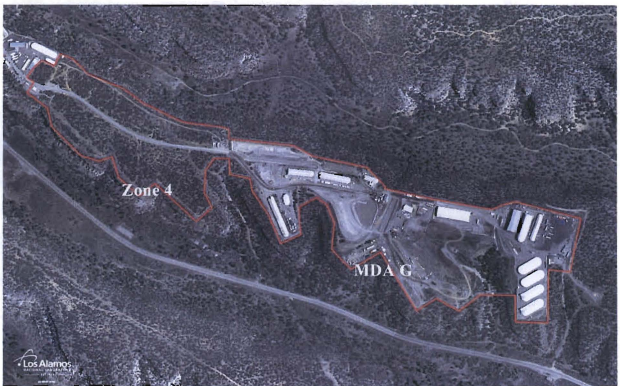
Figure 2. Location of the proposed Zone 4 expansion area relative to MDA G.

Disposal of LLW at TA-54 is authorized by DOE through a Disposal Authorization Statement that is based on a Performance Assessment and Composite Analysis that evaluates the potential for migration of contamination and compares migration to performance objectives (DOE radiation standards for protection of the public). LANL has developed an update to the Performance Assessment on which the current Disposal Authorization is based. The revised Performance Assessment has been reviewed by the DOE Low Level Waste Facility Federal Review Group and a new Disposal Authorization Statement is in the process of being approved by DOE and the National Nuclear Security Administration.