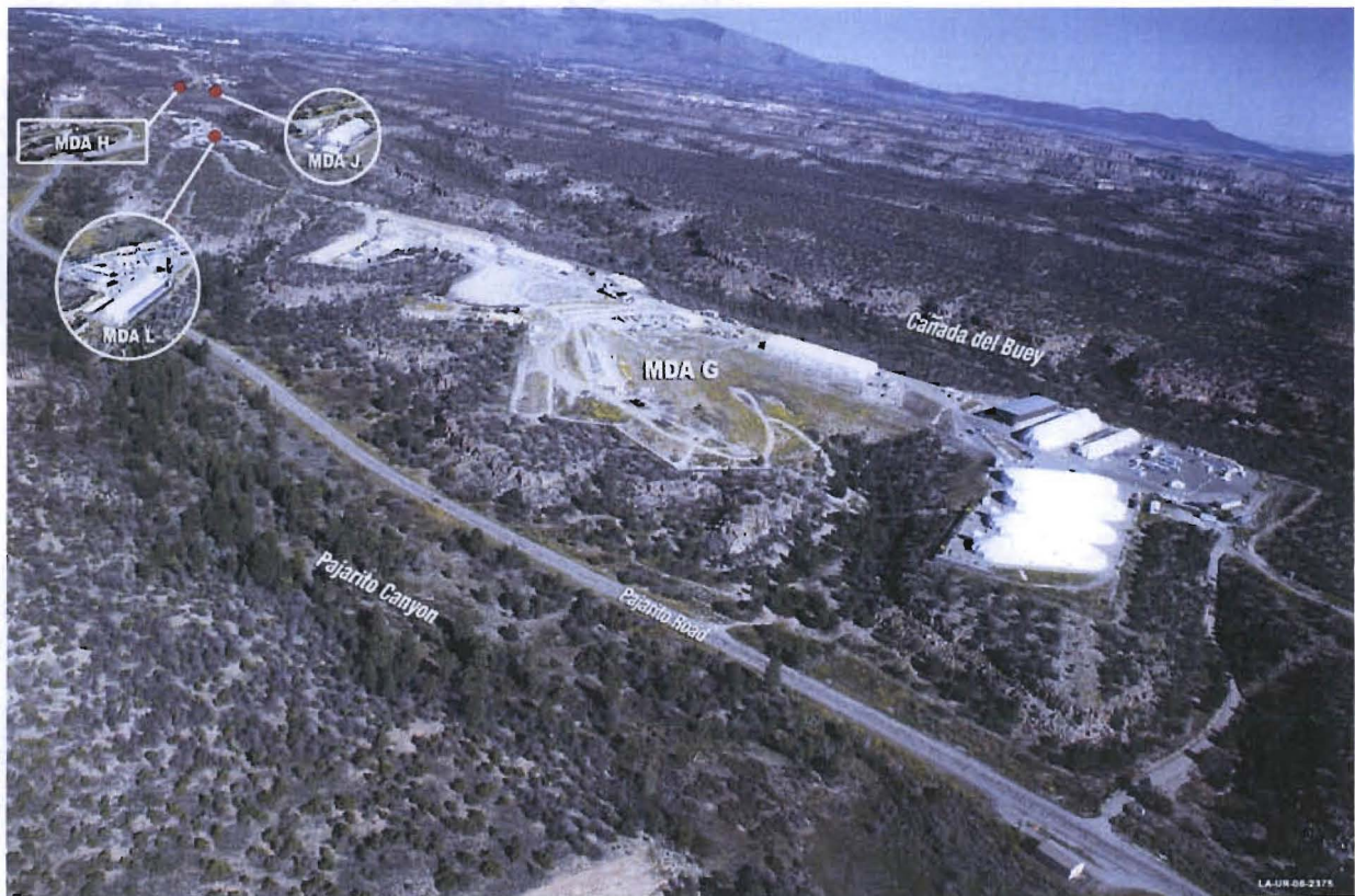
Figure 1. Aerial Photograph of MDA G.

Consent Order with the New Mexico Environment Department, with a scheduled date for closure and remediation of December 2015. The Record of Decision from the 1999 LANL Site-Wide Environmental Impact Statement (SWEIS) states that LANL will continue primarily to dispose of its LLW on-site and will move LLW disposal to an area called Zone 4 after the current disposal area (MDA G) is filled. Zone 4 is located on the same mesa top at TA-54 and just west of MDA G, as shown in Figure 2. The Record of Decision from the DOE Waste Management Programmatic EIS documents DOE's decision that on-site LLW disposal is an option for LANL and that LANL has access to off-site LLW disposal at NTS. The 2008 LANL SWEIS treats the decision to move LLW disposal to Zone 4 as part of the "no-action alternative" but also includes analysis of the impacts of shipping LLW off-site for disposal.