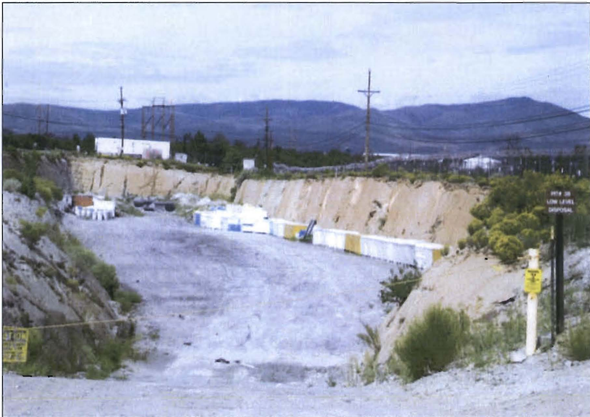
Figure 4. Active waste disposal pit at MDA G.

LLW is disposed at MDA G in unlined pits that are typically 180 to 250 m in length, 45 m in width, and 18 m deep. Higher activity LLW is disposed in shafts that are drilled into the ground and are about 18 m deep, and some 1 to 3 m in diameter. Figure 4 shows a photograph of an active LLW disposal pit at MDA G. Most waste that is disposed is contained within metal boxes, but some low-activity LLW soils are disposed directly without being placed into containers.