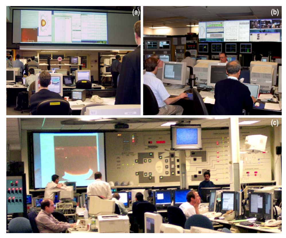
Fig. 2. The control rooms of NSTX (a), DIII-D (b), and C-Mod (c) with shared display walls being used to enhance collaboration. On the DIII-D display is also video from remote collaborators in Europe who were participating in that days experiments.

drawbacks including platform dependencies, limited sharing modes and session initiation difficulties that don't readily lend themselves to the task. To overcome these disadvantages the NFC project has developed and deployed tools that allow for display-sharing and multiuser interaction.