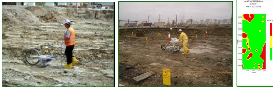
Figure 4. AXISS performing survey and a contour plot of Building-38 survey performed by the AXISS at the MCP in 2004.

The AXISS was used at the MCP to quantify Plutonium-238 concentrations in the field. These in situ measurements are used to establish that cleanup and hot-spot levels for Plutonium-238 have been achieved (i.e., 55 pCi/g and 165 pCi/g, respectively, at MCP). The AXISS provides the ability to rapidly cover 100% of the desired survey area. Collected information is instantly available via the system's real-time data system, and display of field data is available for remedial decision-making. The AXISS possesses protocols for routine system operation that include source checks, energy calibration, efficiency calibration, and background measurements. Automated Quality Assurance/Quality Control (QA/QC) measures are integrated into the control software [3] to provide nearly error-free QA/QC and to provide automatic documentation that is used to validate decisions made to achieve cleanup goals. Automated features on the AXISS dramatically reduce labor requirements as well as errors due to factors associated with human nature, such as fatigue and repetitive activity.