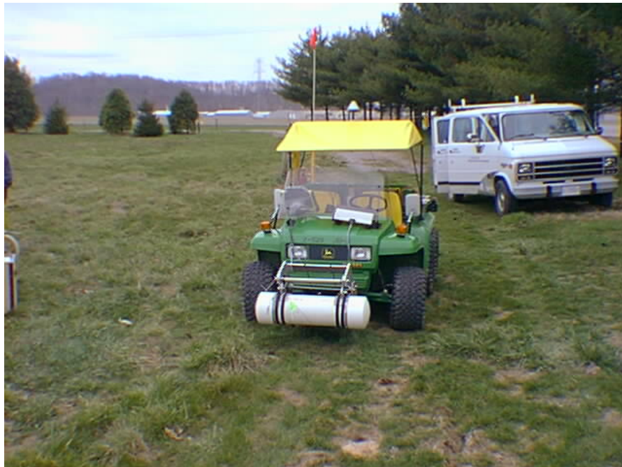
Figure 2. The Gator real-time system.

The INL provided integrated engineering computer hardware and software support to greatly streamline the data acquisition and analysis process to the point where activity and coverage maps were available to the field technicians in near real time. The characterization system developed for the FCP was designed to operate from multiple platforms. The original platform used as the FCP was deployed from a large tractor-based vehicle called the Radiation Tracking System (RTRAK). The RTRAK provided the delivery or deployment system, but the acquisition and analysis hardware and software were designed and implemented by the INL. This acquisition and analysis system was deployed from five additional vehicles, which included four hand-pushed deployments dubbed the Radiation Scanning System (RSS) and an ATV-based system called the Gator, shown in Figure 2. The RTRAK was eventually retired towards the end of the FCP closure activities. Functionally, the RTRAK, RSS, and Gator platforms were identical and simply represented three different methods for mobile-deployment of the detectors and the real-time software analysis system.