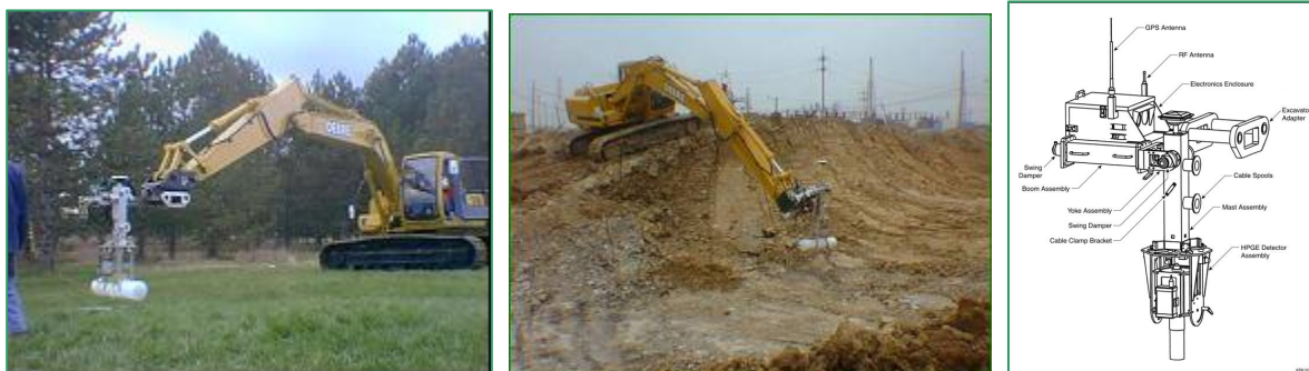
Figure 3. EMS NaI platform is used to survey trenches.

Real-time gamma measurements can be made in several modes including stationary measurements at a prescribed detector height or offset, and mobile scanning measurements can be made with either detector at a prescribed detector height and scanning speed. Either gross activity or spectrometric measurements can be collected in any of these modes. All stationary or mobile measurements are tagged with the detector location. The movement of the EMS-mounted detector over the survey area is tracked using either GPS or a laser-based tracking system that traces detector location on display screens in the excavator cab and in the support van.