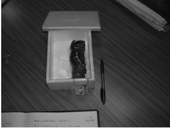
Figure 2. Thermal neutron shielding enclosure with hamster phantom.

Measurements of the neutron flux at the irradiation location were performed using simplified extensions of neutron activation techniques [3] that have been adapted for BNCT applications by the INL. All irradiations were conducted at a reactor power of 8 MW.