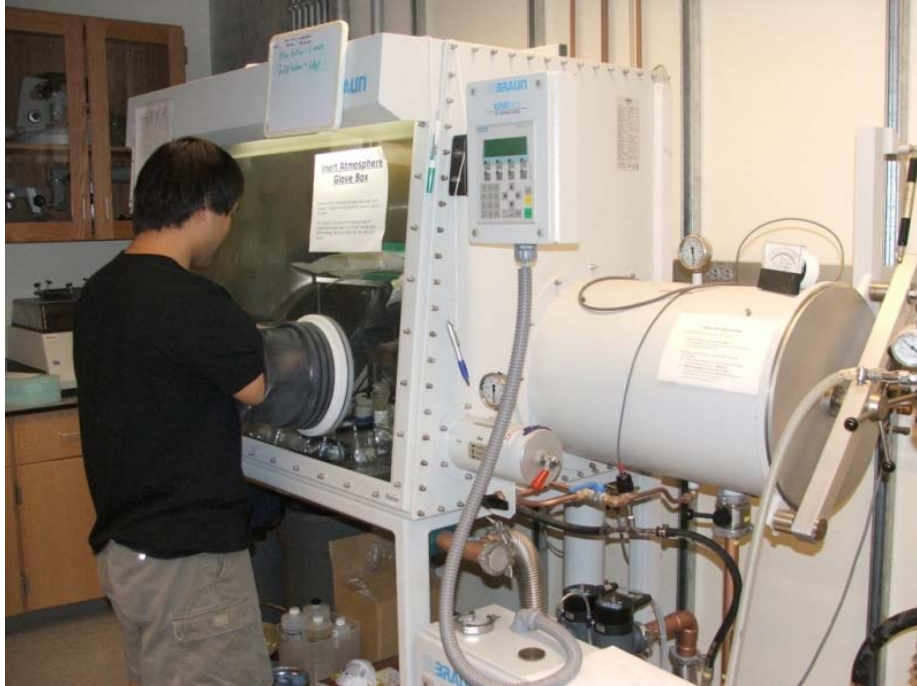
Figure 1.2 – The argon glove box serves to handle and store air sensitive materials.

Several experiments were carried out to test the new equipment, which also served as starting points to this new phase of our research program. The following paragraphs briefly describe some of the most important achievements made possible by the new materials synthesis and crystal growth facility.