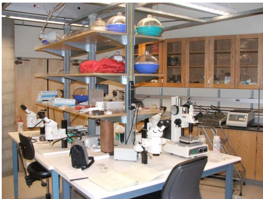
Figure 1.1 – The new sample preparation laboratory. Several microscopes are used to work with the samples.

During the period of time covered by this grant (2004 – 2008), we set up our new, improved, single crystal growth facility. We purchased three major pieces of equipment (the optical floating zone furnace or mirror furnace, the tetra-arc furnace and the D8 diffractometer), along with other systems and upgrades to older systems that enable us to continue with the flux-growth single crystal technique and to characterize the physical properties of the samples grown in this laboratory. An example of this complementary equipment is a new leak detection system, which was purchased and is frequently used to test the various high vacuum chambers of our furnaces and other equipment. Our new facility is now located in the newly constructed addition to Mayer Hall, the building housing the Physics Department at UCSD. Figures 1.1 and 1.2 show one of the rooms of the new facility, and the newly purchased equipment can be seen in the following figures.