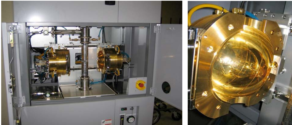
Figure 1.5 – (Left) The image furnace main chamber. (Right) Detail of one of the gold-plated mirrors.

NCCO ( \text{Nd}_{2-x}\text{Ce}_x\text{CuO}_4 ) bulk single crystals were successfully grown in the image furnace using a modified TSFZ. The positions of the feed and seed were switched compared to other growths, a solvent pellet of mostly CuO was kept in the molten zone to reduce the melting point of NCCO and portions of the reflected light from the halogen bulbs were screened to create a steeper temperature gradient. NCCO was also grown in a mixture of pure argon and pure oxygen. Magnetization measurements performed in the SQUID magnetometer showed that the materials were superconductors with T_c = 20 K, which corresponds to the optimally doped region reported in the literature.