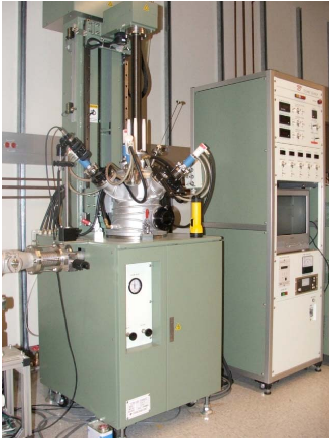
Figure 1.3 – The tetra-arc furnace in its current location. The CCD camera mounted outside of one of the three window ports allows us to record the growth in a video. Videos can be viewed at our website ( http://mbmlab.ucsd.edu/facility.html ).

participation of other investigators from various institutions: Jonathan Denlinger (Lawrence Berkeley National Laboratory), x = 0.8 for ARPES studies; Elizabeth Blackburn (U. Birmingham), x = 0 , small angle scattering; Jeff Lynn (NIST), x = 0 , neutron scattering under pressure; Pengcheng Dai (U. Tennessee and Oak Ridge National Laboratory) with various Re concentrations for neutron scattering; Jason Jeffries (Lawrence Livermore National Laboratory), x = 0 , for high pressure measurements and TEM studies; Ali Yazdani (Princeton U.), x = 0 , for STM studies. Besides the \text{URu}_{2-x}\text{Re}_x\text{Si}_2 doping study, we are currently working on the growth of \text{UGe}_2 , \text{URhGe} and \text{UCoGe} single crystals.