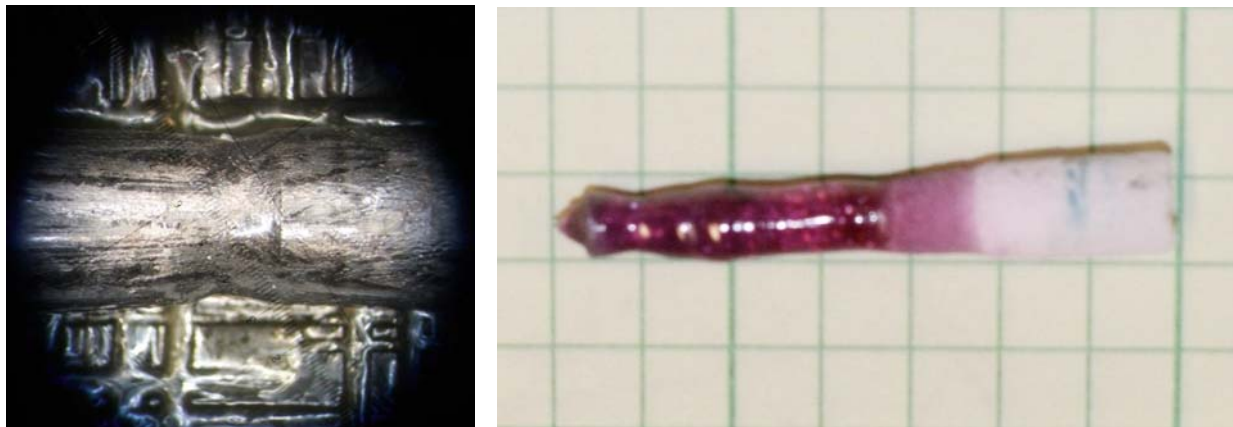
Figure 1.6 – (Left) A photograph of an NCCO single crystal grown in the mirror furnace. (Right) A 2 cm long single crystal of ruby .