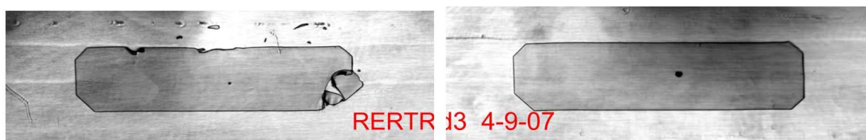
Fig 1: Ultrasonic scans of fuel plates fabricated by FSW with a flawed HEU-10Mo foil (left) and uniform HEU-10Mo foil (right).

Thus, the current update will provide results of studies that are underway and future plans to investigate the mechanical properties of the fuel alloys and cladding material, processing-parameter relationships, composite behaviour and residual stresses induced by friction bonding.