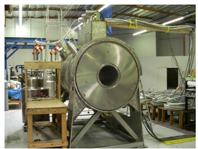
Fig. 3. Finished Spectrometer Solenoid 1 before the Magnet Cool-down

Laboratory in the UK a bit easier. The problem with the use of drop in coolers is that from 0.2 to 0.3 W of cooling is lost when the cooler is installed in a drop-in cooler sleeve at the top of the magnet cryostat [12]. With three coolers installed on the magnet, the effective available cooling power at 4.2 K is from 3.6 to 3.9 W instead of 4.5 W.