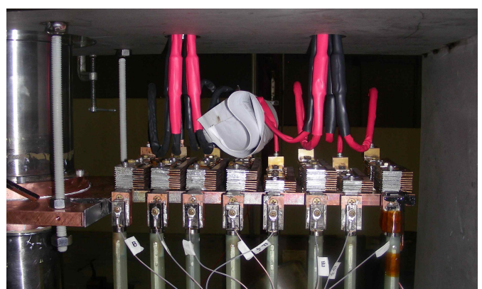
Fig. 2. The HTS and Copper Leads for the MICE Spectrometer Solenoid