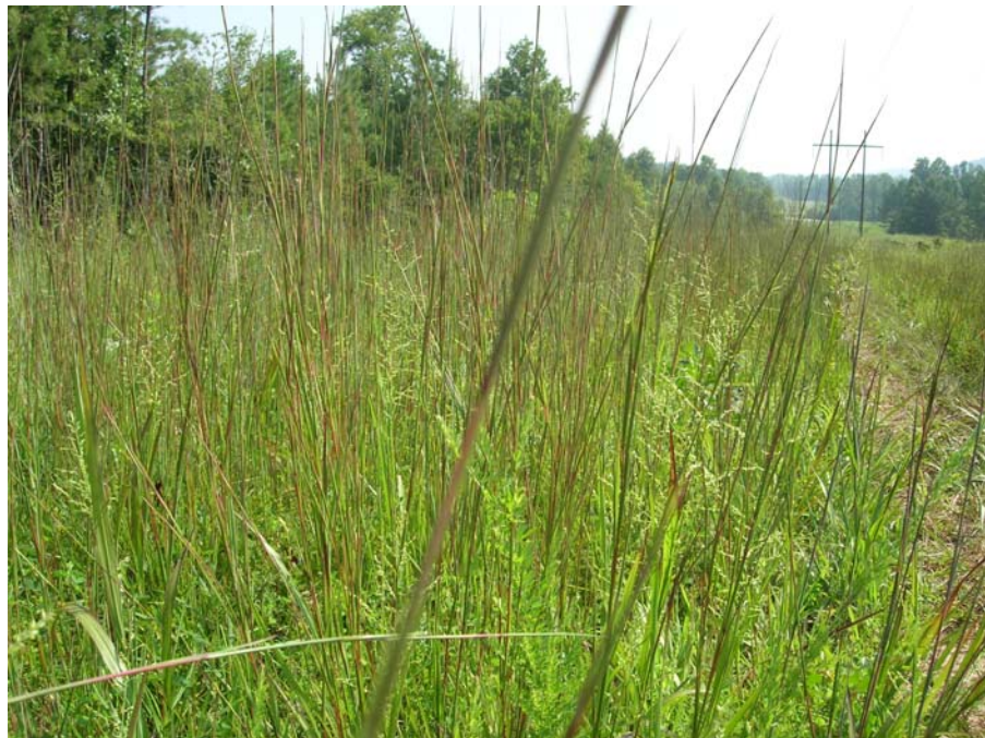
Fig. 4. Little bluestem ( Schizachyrium scoparium ) along power line right-of-way.

scoparium , Fig. 4), and sideoats grama ( Bouteloua curtipendula ). The first four species in this list are “tall” grasses, ranging from approximately 3 to 8 ft (1 to 2.4 m) in height and are typical components of the Tall or Mixed Grass Prairies. Little bluestem and sideoats grama grow from 2 to 4 ft (0.6 to 1.2 m) tall and occur in the Short and Mixed Grass Prairies (Brown 1979).