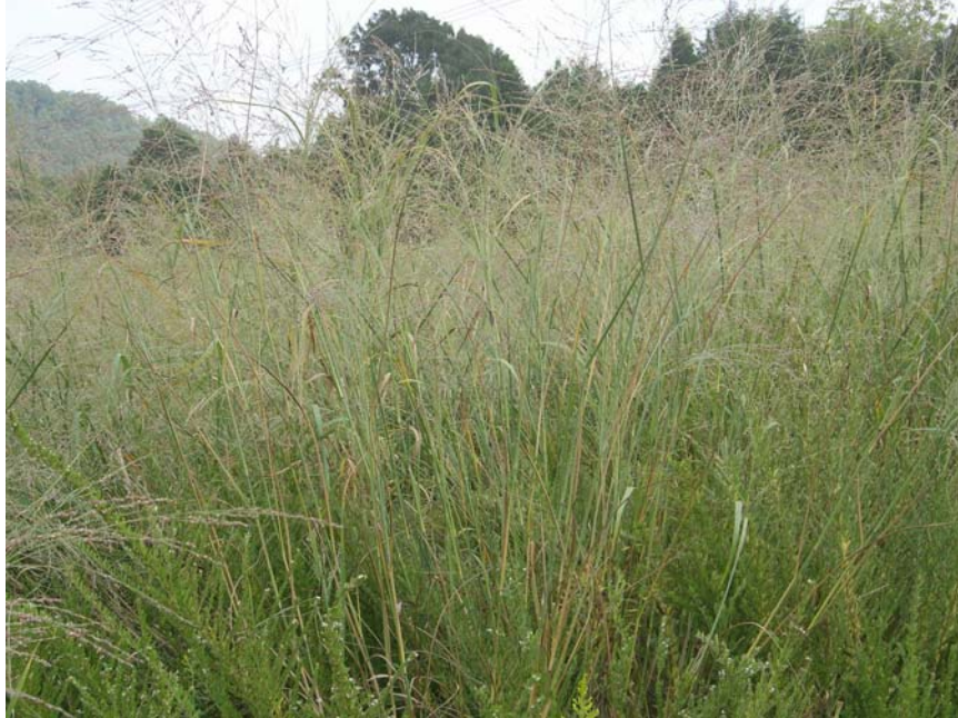
Fig. 3. Switch grass ( Panicum virgatum ) showing seed heads.

scoparium , Fig. 4), and sideoats grama ( Bouteloua curtipendula ). The first four species in this list are “tall” grasses, ranging from approximately 3 to 8 ft (1 to 2.4 m) in height and are typical components of the Tall or Mixed Grass Prairies. Little bluestem and sideoats grama grow from 2 to 4 ft (0.6 to 1.2 m) tall and occur in the Short and Mixed Grass Prairies (Brown 1979).