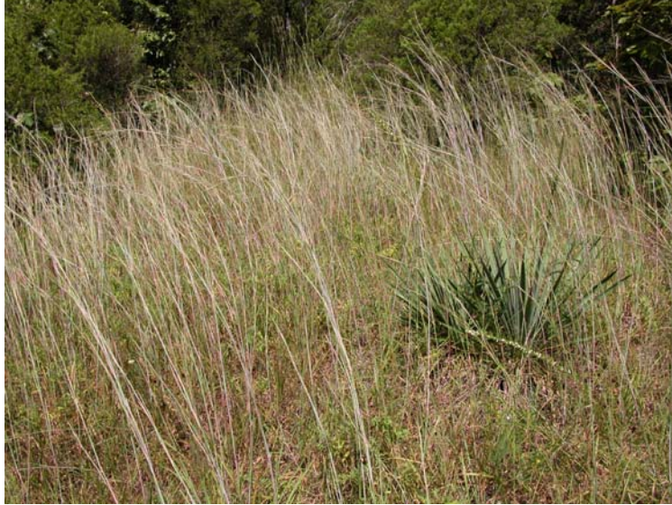
Fig. 1. Big bluestem ( Andropogon gerardii ) in cedar barren habitat.