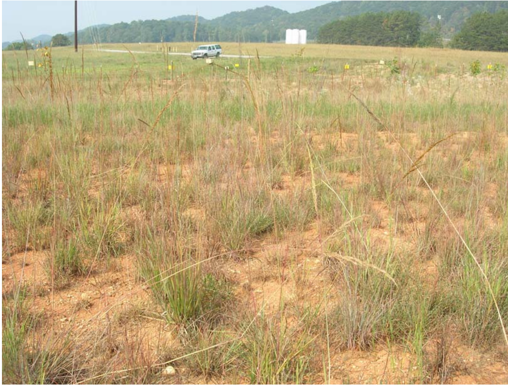
Fig. 5. Warm-season grassland with open spaces between bunches of grasses.

In contrast to native grasslands, fescue fields have limited wildlife benefits. The dense, matted structure of tall fescue stands fails to provide cover, and the lack of bare ground prevents the easy movement, foraging, and nesting of animals in a field (Barnes et al. 1995). Tall fescue and other nonnative grasses often spread quickly, forming monocultures wherever they are planted. Tall fescue is often considered a nonnative invasive species (Miller 2003). Another drawback to planting tall fescue is an endophytic (i.e., living within the tissues of the grass) fungus ( Neotyphodium coenophialum ) that infects 97% of all tall fescue fields. (Native grasses are not susceptible to the fungus.) This fungus, although beneficial to the grass (infected fescue plants are more vigorous, more drought-resistant, and better tolerate poor soils), is toxic to herbivores (Bacon and Siegel 1988). Infected fescue is detrimental to wildlife because the endophyte produces alkaloids that are toxic to many species. Tall fescue seeds are also known to have potentially harmful effects on northern bobwhite, some songbirds, and Canada geese ( Branta canadensis ). Many bird species have been shown to eat fescue seeds only as a last resort when other foods are offered (Conover and Messmer 1996). Some species might alter feeding habits in the wild to avoid fescue (Clay and Holah 1999).