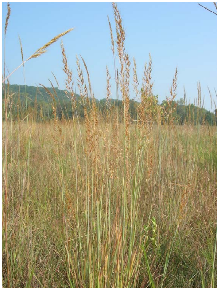
Fig. 2. Indian grass ( Sorghastrum nutans ) showing seed heads.