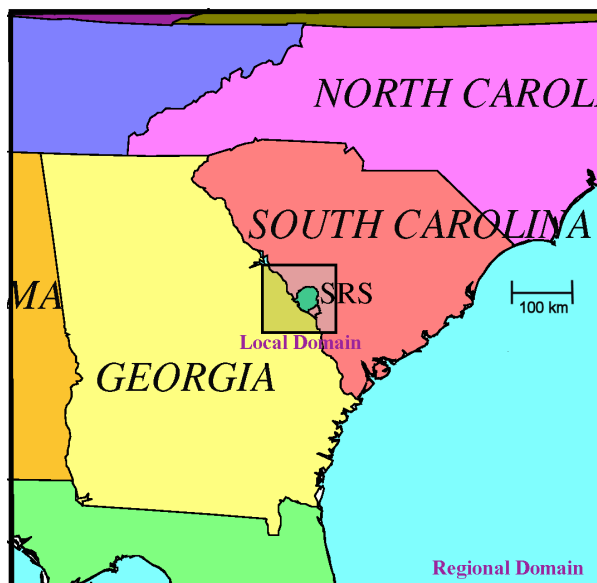
Figure 1: Modeling domains used operationally at SRNL.

coordinate system with variable vertical resolution. The prognostic model is used routinely at the SRS to provide forecasts on both regional and local scales (Fig. 1). The RAMS model is capable of simulating a wide range of atmospheric motions due to the use of a nested grid system. Other features are discussed in the references. Improvements in the newer version (R43) include the use of a new land-surface scheme, as well as parallel computing options.