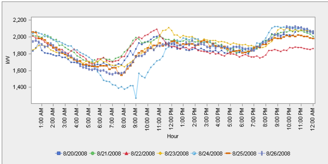
Figure 1: Municipal Wastewater Treatment Facility Load Pattern

peak flow during the early evening between 7 and 9 p.m. 4 Figure 1 shows a sample summer load pattern for a municipal wastewater treatment facility.