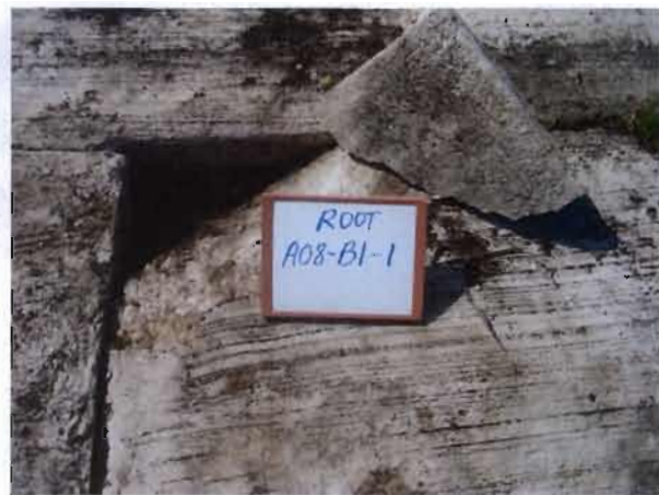
6" deep broken corner #2.