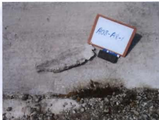
Spalling at panel edge.