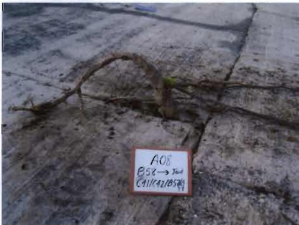
Vine #1 rooted in joint.

Vegetation taking root in joints occurred in 4 to 5 locations, but did not appear to have penetrated the concrete panels.