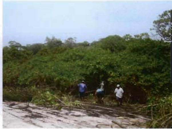
Brush at lower elevations.

Vegetation taking root in joints occurred in 4 to 5 locations, but did not appear to have penetrated the concrete panels.