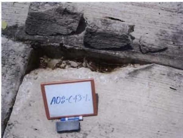
6" deep broken corner #1.

Breaking/chipping occurred in two locations at the panel corner and were about 6" deep.