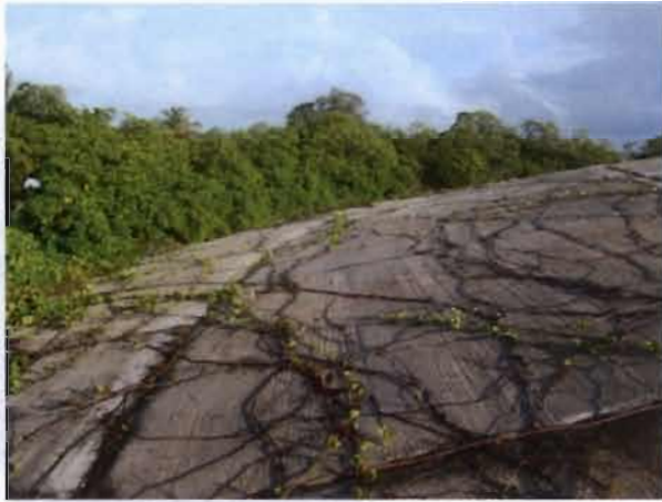
Vines at higher elevations.

Vegetation growing on the surface of the panels was prevalent in some areas and nonexistent in others.