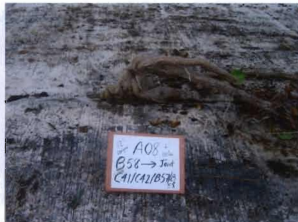
Vine #2 rooted in joint.