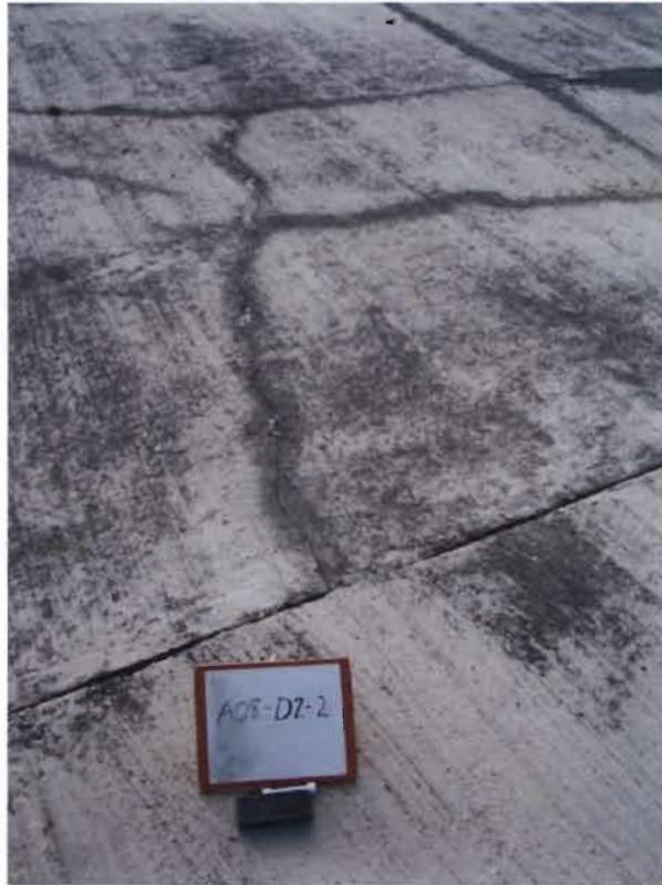
Vertical and horizontal cracks.

Cracking for the most part would be considered hairline, although some were approximately 1/64 to 1/16 of an inch wide. Cracks tended to run vertical versus horizontal, and most ran from panel edge to panel edge.