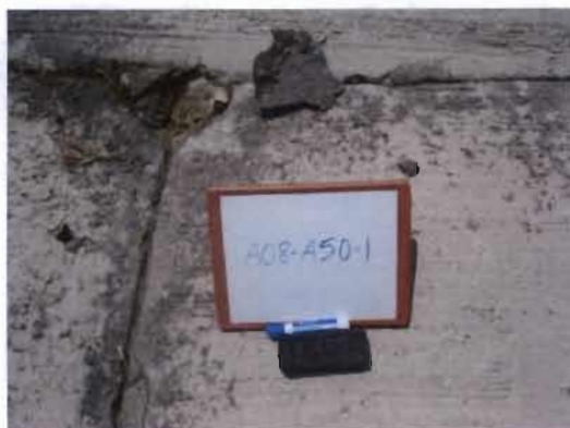
Spalling at panel corner

Spalling was very prevalent across the entire dome. Although spalling was found more at the panel corners, there was significant spalling along the joint edges, and sometimes along cracks on the interior of the panel.