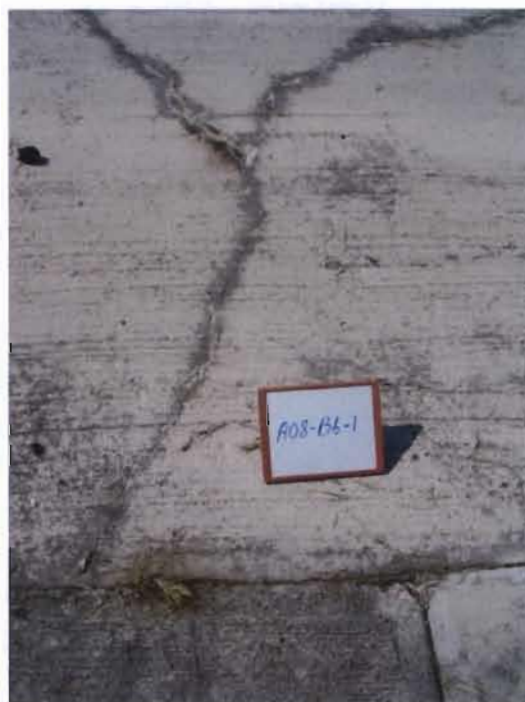
Spalling along interior crack.