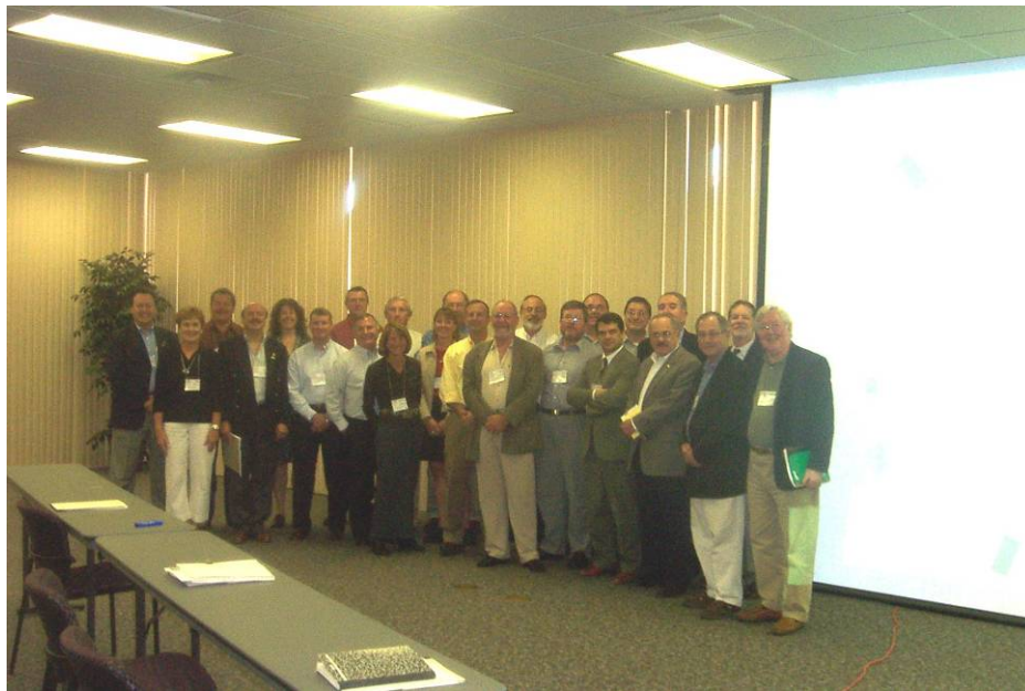
Figure 5. The NorthAm Fest participants

In conclusion, the fest accomplished its objectives and those involved seemed convinced that these types of informal, participatory interactions between cultures are highly useful. A series of fledgling relationships were begun between individuals and organizations and there are commitments to follow up with future meetings. One of the key agreements from the fest was for a set of participants representing the three countries to publish a joint paper outlining the elements of a Continental Security plan. The Advanced Concepts Group was encouraged by the results of the fest and by the general consensus of the participants that adopting a continental approach could result in better security for our three nations.