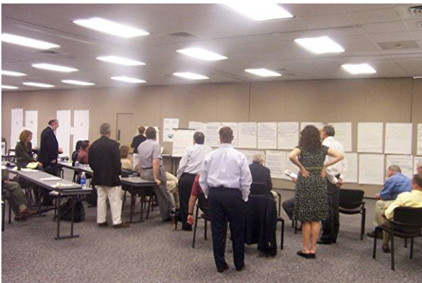
Figure 4. Roadmap session

Finally, a "Tri-National Security Laboratory" was envisioned that could bring together researchers and practitioners to develop and test new counter-terrorism technologies and processes.