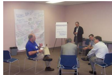
Figure 3. Small group session

The biggest economic challenge in accomplishing the creation of a continental security system will be getting effective security without impeding the flow of commerce. More regulation creates higher costs too. But for continental security systems there is an added challenge of the infrastructure differences among the three countries. This may require larger investments for one or more countries with more sharing of cost. The cost of new policies and infrastructure and technology maybe more difficult now the under economic stress that is possible in U.S. and with Mexico having fewer resources than the other two nations. Getting the private sector to invest where necessary will also be a challenge. If we develop a protectionism approach, the impact on our economies given the current trends toward globalization may be dire.