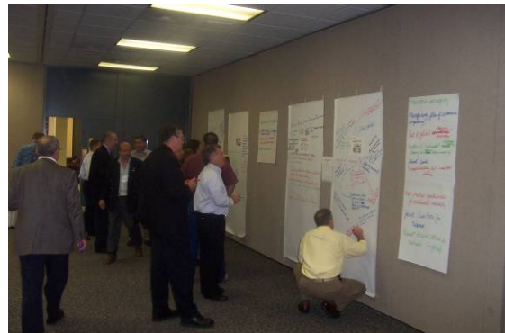
Figure 1. Large group written brainstorm

The process used was a combination of written brainstorming and small group sessions followed by large group discussions. The written brainstorms were carried out on large pieces of poster paper placed on the wall with the session subtopic identified at each station. Participants were given about 45 minutes to move about the room and enter their ideas and react to the ideas of