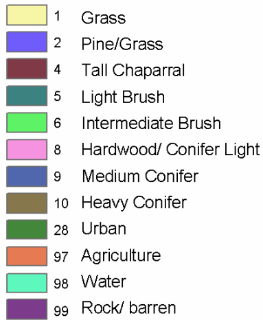
Figure 2 Fuel map of the Santa Barbara South Coast region. Data Source: California Department of Fire ( frap.cdf.ca.gov )