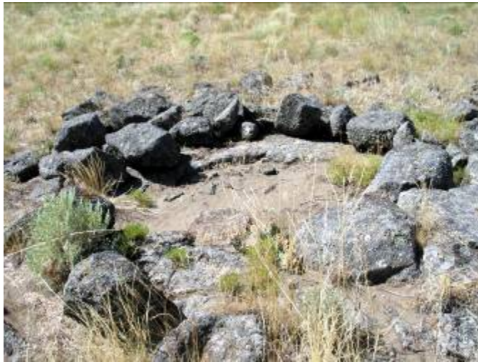
Figure 3. Rock ring (probable hunting blind from INL).