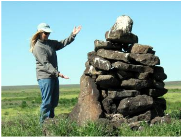
Figure 2: Rock cairn from INL (note evidence of roosting birds on upper rocks)