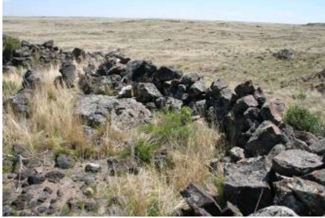
Figure 4. Substantial rock structure from INL (Hellofasite).