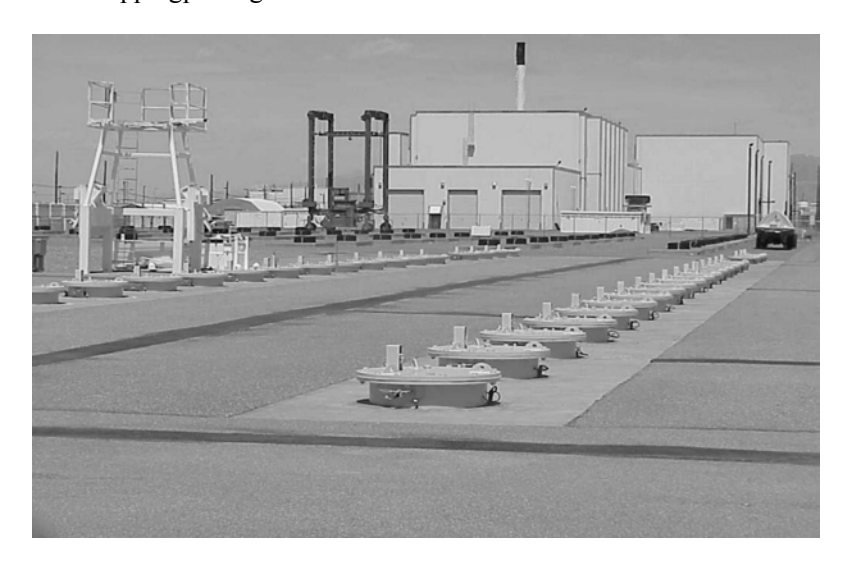
Figure 3. The Below-grade Storage Facility CP-749 at the INL Used to Dry Store Peachbottom Reactor SNF

INTEC has four different types of dry storage, not counting the dry storage cask systems. The Irradiated Fuel Storage Facility (IFSF) is an air-cooled vault originally built to store the Fort St. Vrain SNF. It presently stores many different types of SNF. The first generation of storage caisson, CPP-749, has steel-lined below-grade individual vaults, built to store Peachbottom graphite SNF (a general view of the CPP-749 facility is shown in Figure 3). The second generation caissons were a significant improvement in design and were built to store the Shippingport light water breeder reactor SNF.