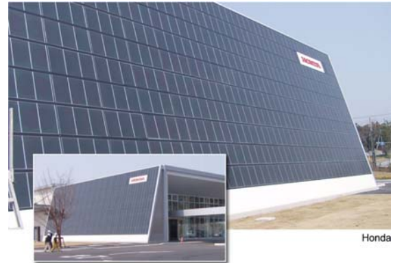
Figure 5: Building-integrated thin-film CIGS façade on a Honda building in Japan

It is estimated that by 2010, the production capacity for thin-film PV technologies worldwide will be more than 3700 MW, as depicted in Table III. The table is divided into various regions of the world. The United States — is estimated at 1127 MW, Japan at 1312 MW, Europe at 793 MW and Asia at 472 MW for thin-film PV production capacity.