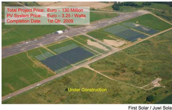
Figure 4: A 40-MW thin-film CdTe solar field being built in Saxony, Germany to be completed in early CY 2009

As thin film PV technologies matures, applications get larger in size for installed solar arrays. First Solar, along with Juwi Solar, Germany, is installing a 40-MW thin-film CdTe solar field in Saxony, Germany. The project, shown in Fig. 4, is currently under construction and will be completed by early CY 2009. Thus far, 6-MW of the solar field has been installed. When completed, this will be one of the largest solar fields in the world. The total price of this project is Euro 130 million. Thus, the installed PV system price is Euro-3.25 per watt, also the lowest installed price for any PV system in the world. Figure 5 shows a thin-film CIGS facade installed on a building by Honda in Japan. The system size is estimated around 22-kW.