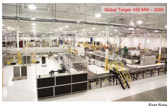
Figure 2: First Solar's 90-MW thin-film manufacturing plant in the USA

First Solar (FS) is clearly the world leader in all thin-film PV technology development and global sales. They have an installed capacity of 90 MW in Perrysburg, Ohio for the manufacture of thin-film CdTe power modules, shown in Figure 2. FS has also recently started a new facility in Germany with an installed manufacturing capacity of 120 MW.